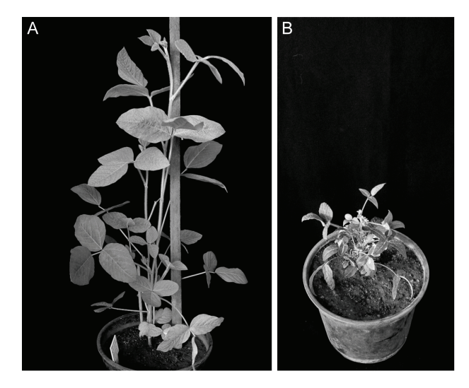
Fig. 2. Mutated line 1A presenting a normal phenotype (A) and the mutated line 8C (treated with 350 Gy) presenting dwarfism and wrinkled leaves (B).

The 36 plants analyzed by PCR were allowed to grow to maturity and set pods. Thirty plants, including plant 1A, presented a normal phenotype with normal growth, pods and seed production (Fig. 2A). On the other hand, two plants presented dwarfism as well as wrinkled leaves and pods (Fig. 2B), and four presented a base-branched phenotype.