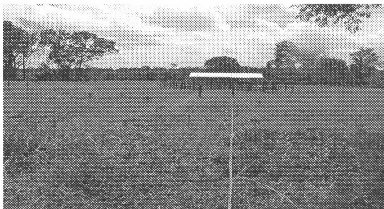
Figure 1. Electrified fences with Kaya ivorensis and Azadirachta indica .

This work is installed in Embrapa Eastern Amazon, in Belém, Para State, Brazil (1° 28' S and 48° 27' W). The climatic type is the Afi, characterized by abundant rains during the entire year, more intensive, from december to may, and less rainy, from june to november, with 2.870 mm/year of pluviometric precipitation. The annual average temperature is 26°C, the relative humidity 85% and annual insolation of 2.400 hours (2, 3, 4). The experimental area of about six hectares divided in six paddocks, with cultivated pasture Cynodon nlemfuensis , managed with five days of occupation, 25 days of rest and pasture cycle of 30 days. For implantation of the pasture plowing and harrowing to break clods and leveling were effected. After that 300 kg/ha of natural phosphate Arad was applied, contends 33% of P 2 O 5 . Along the electrified fences, are planted african mahogany ( Kaya ivorensis ) and indian nim ( Azadirachta indica ), 4 m intercalated (Figure 1), and fertilized with chemical and organic fertilizers, aiming to improve the animal ambience and to add value to the property, through the implantation of silvipastoril system.