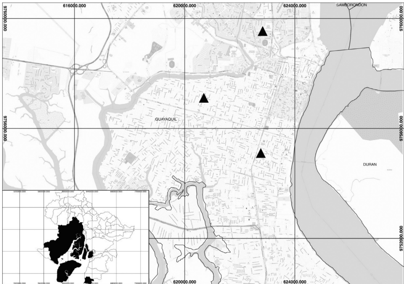
Fig. 2. Letamendi, Febres Cordero and Tarqui (triangles), Guayaquil city urban districts where Diaphorencyrtus aligarhensis was detected. The lower box represents where the city is located.

natural enemies, in some localities, could be directly related to the indiscriminate application of chemicals used to control insects and mites, as well as D. citri .