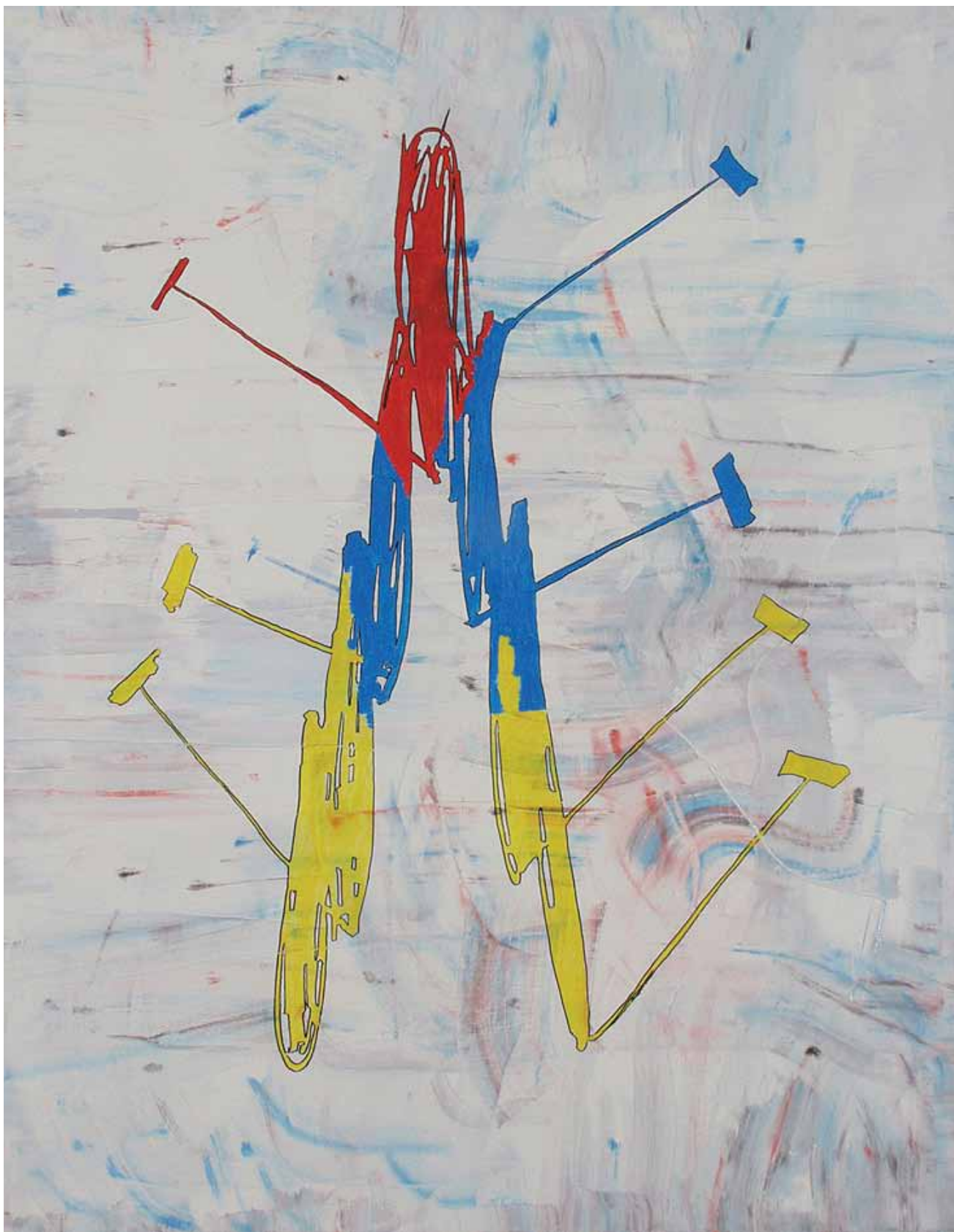
Tri boje u zraku, 2002. ulje na platnu 146 x 114 cm, fotograf: Darko Bavoljak