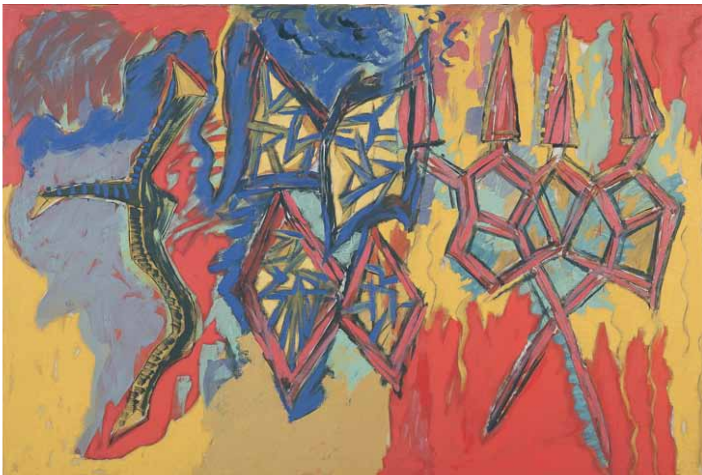
Postelja tiranina, 1983. ulje na platnu 130 x 195 cm, fotograf: Goran Vranić

His painting began in the late 1970s during the era of post-modernism, a turning point in the world of the arts that renewed interest in classical disciplines and compositions. It was at this time that the transavantgarde came about in Italy, one of the final artistic styles of the 20th century, which was referred to in the Croatian arts as “new painting” (hr. nova slika ). The author who theoretically articulated this style, famous curator Achile Bonita Oliva, invited Rončević and a handful of other Croatian painters