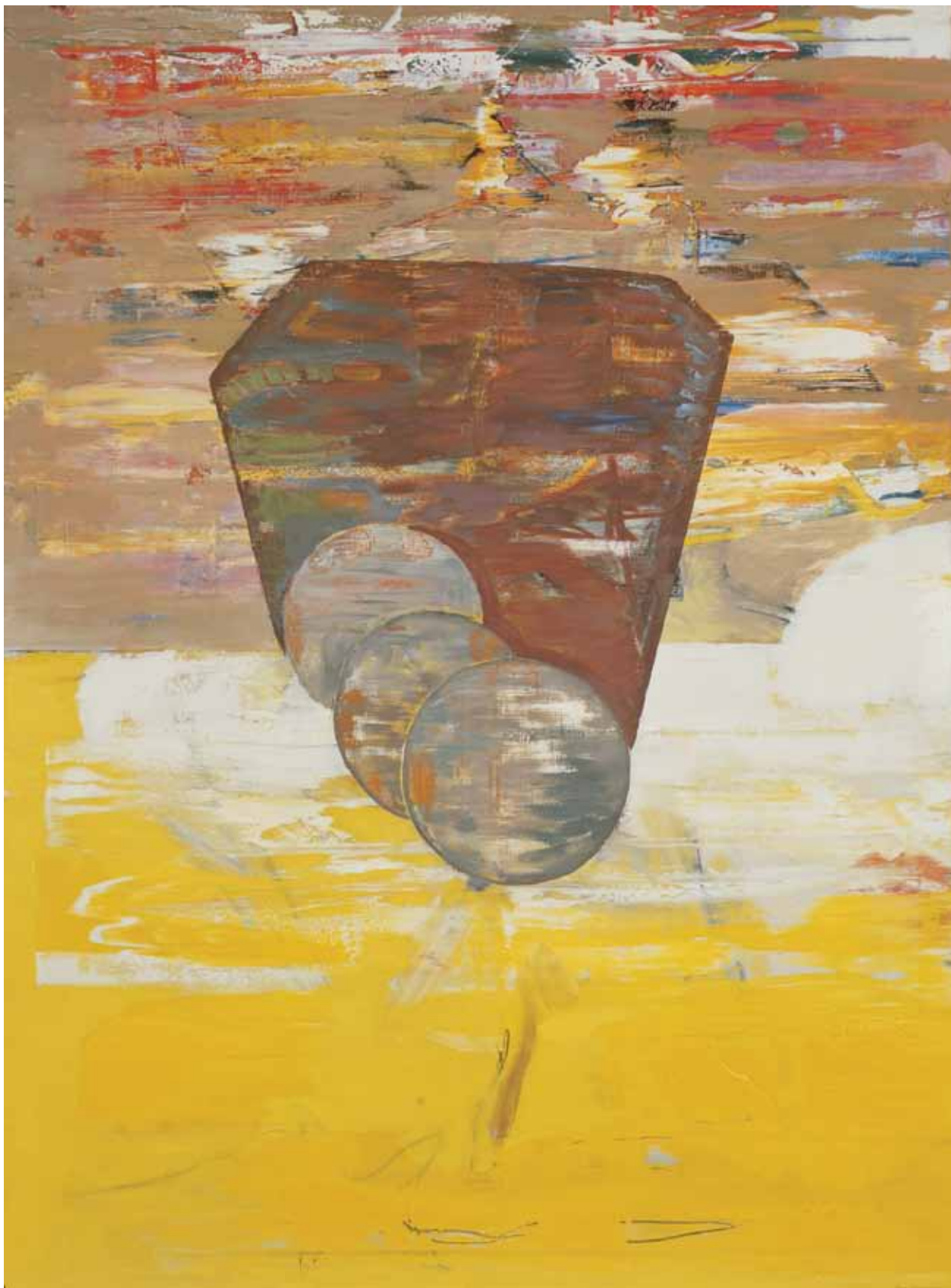
Pjesma stvorenja – zagrobno, 1993. ulje na platnu 195 x 130 cm