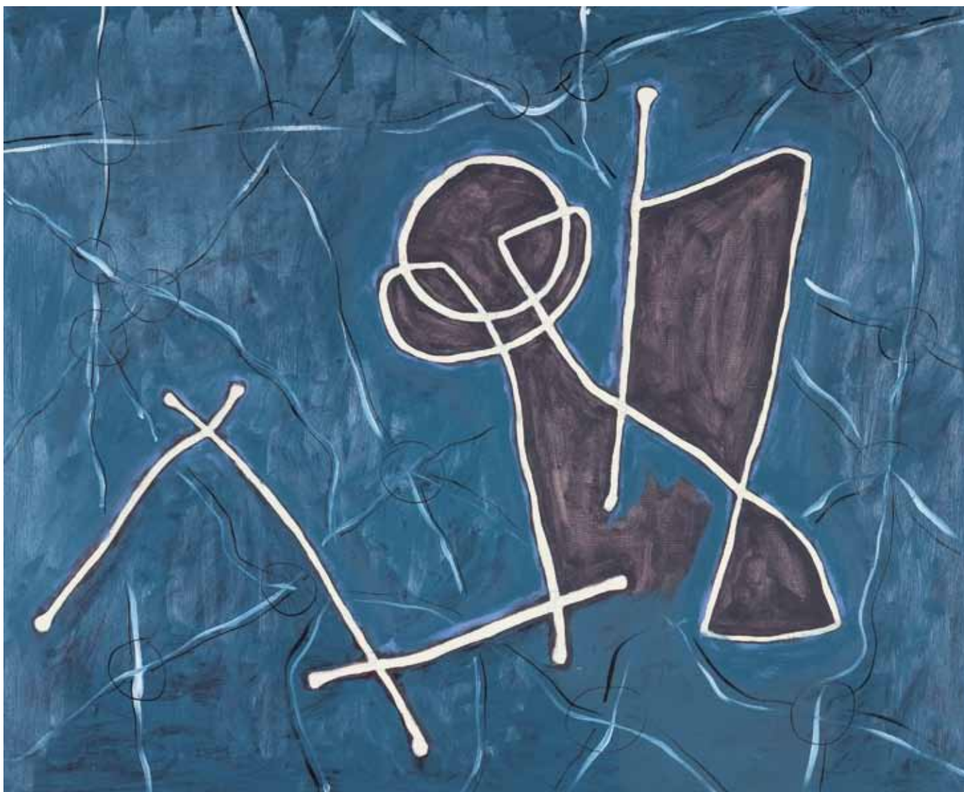
Transkripcija, 1988. ulje na platnu 81 x 100 cm