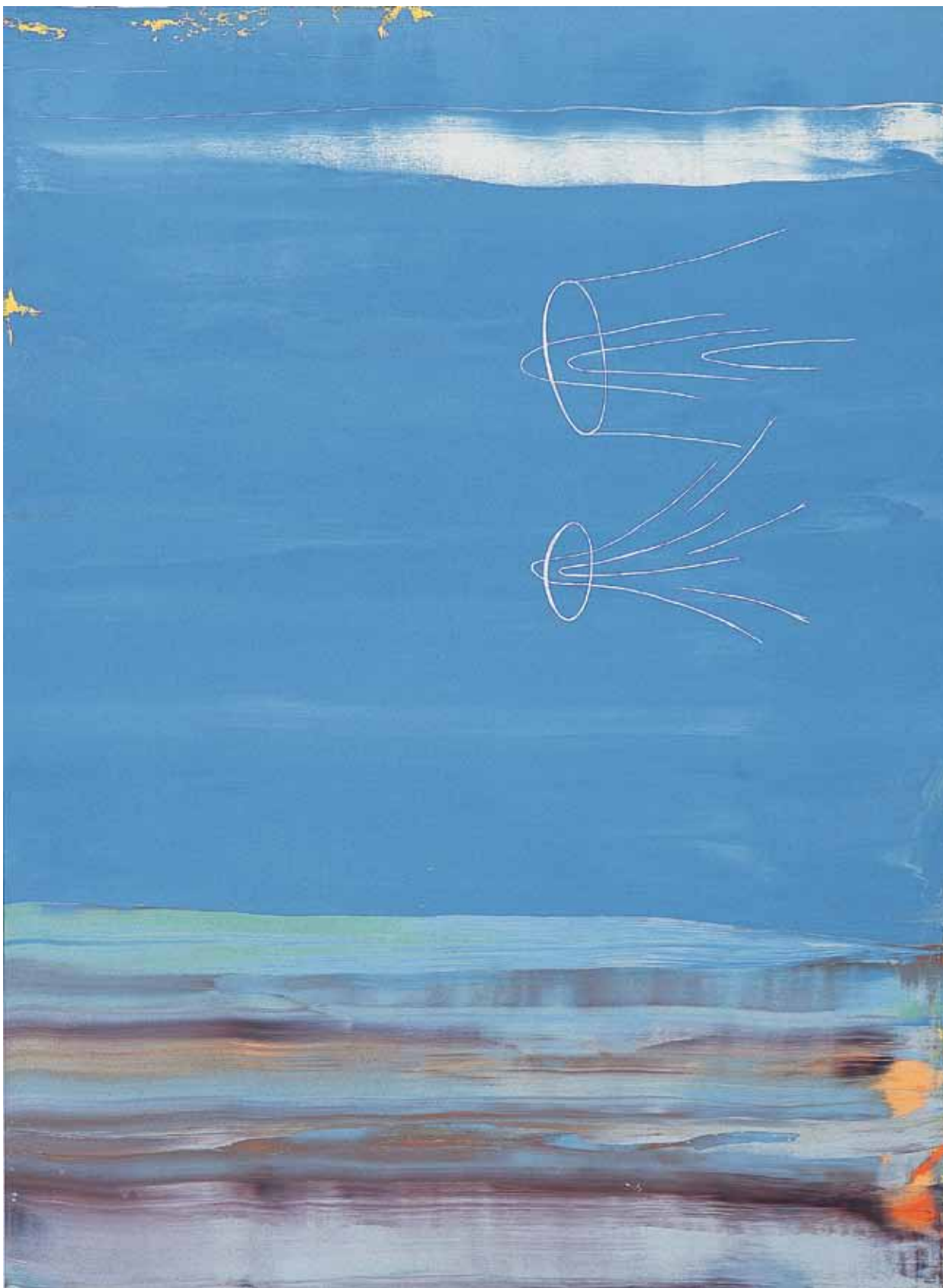
Otac i sin, 2003. ulje na mdf-u 69,5 x 51 cm, fotograf: Darko Bavoljak