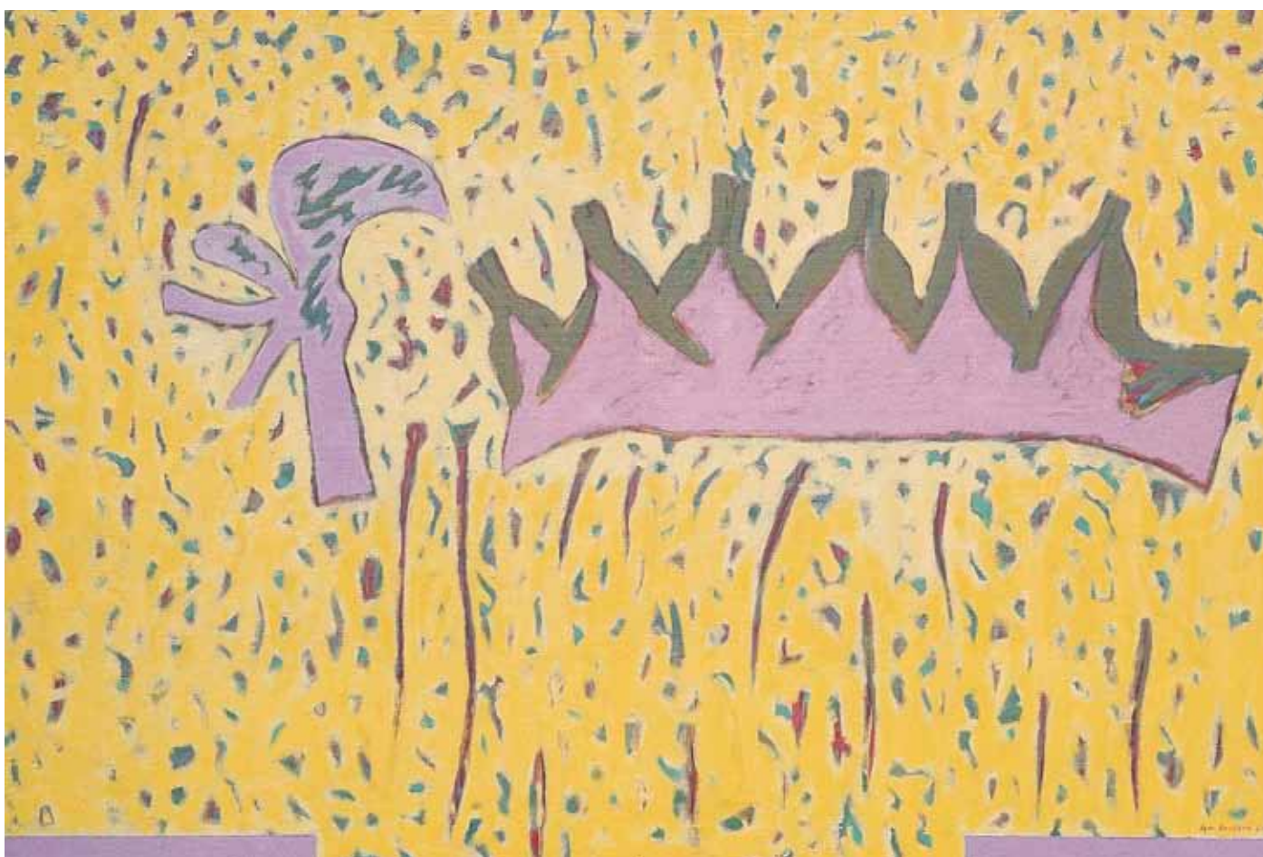
Iz života na selu, 1980. ulje na platnu 122 x 178 cm

He is one of the most agile, uncompromising painters on the Croatian arts scene. His opus is vibrant and inspiring to the numerous generations of young painters he has taught as a professor at Zagreb's Fine Arts Academy. Rončević is an exceptional figure in Croatian late-20th-century painting; his rich artistic language of wondrous polyphony is among the finest and most valuable in the Croatian fine arts. His creativity has broadened the horizons of modern Croatian painting, thus strengthening his position as a unique, exceptionally cultivated painter. By the early 1980s, critics had recognised his originality, highlighting it as a new artistic value in