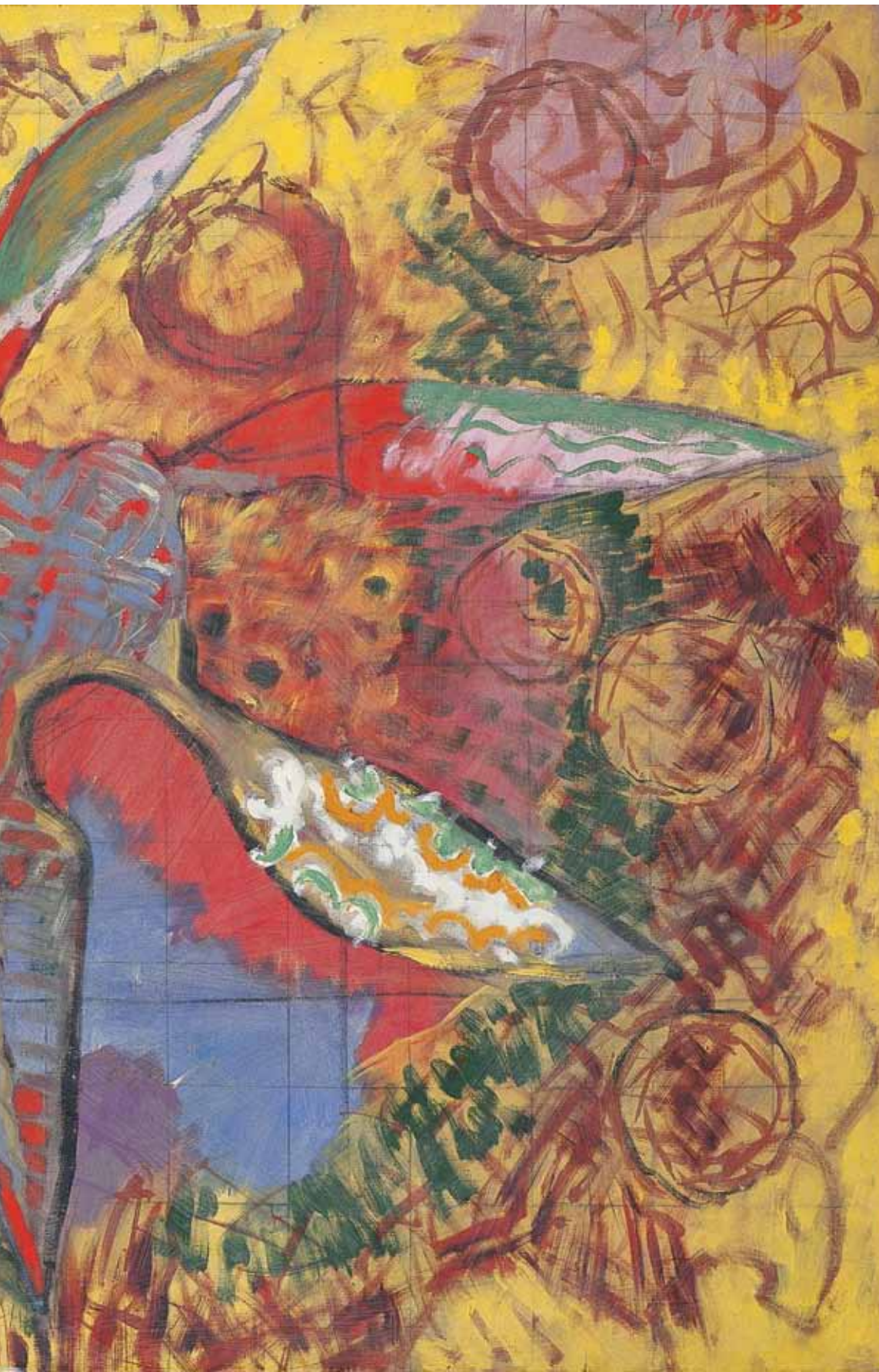
Šesterokrak, 1984. tempera i ulje na platnu 97 x 130 cm, fotograf: Darko Bavoljak

Six-pointed, 1984. Tempera and oil on canvas 97 x 130 cm, photograph: Darko Bavoljak