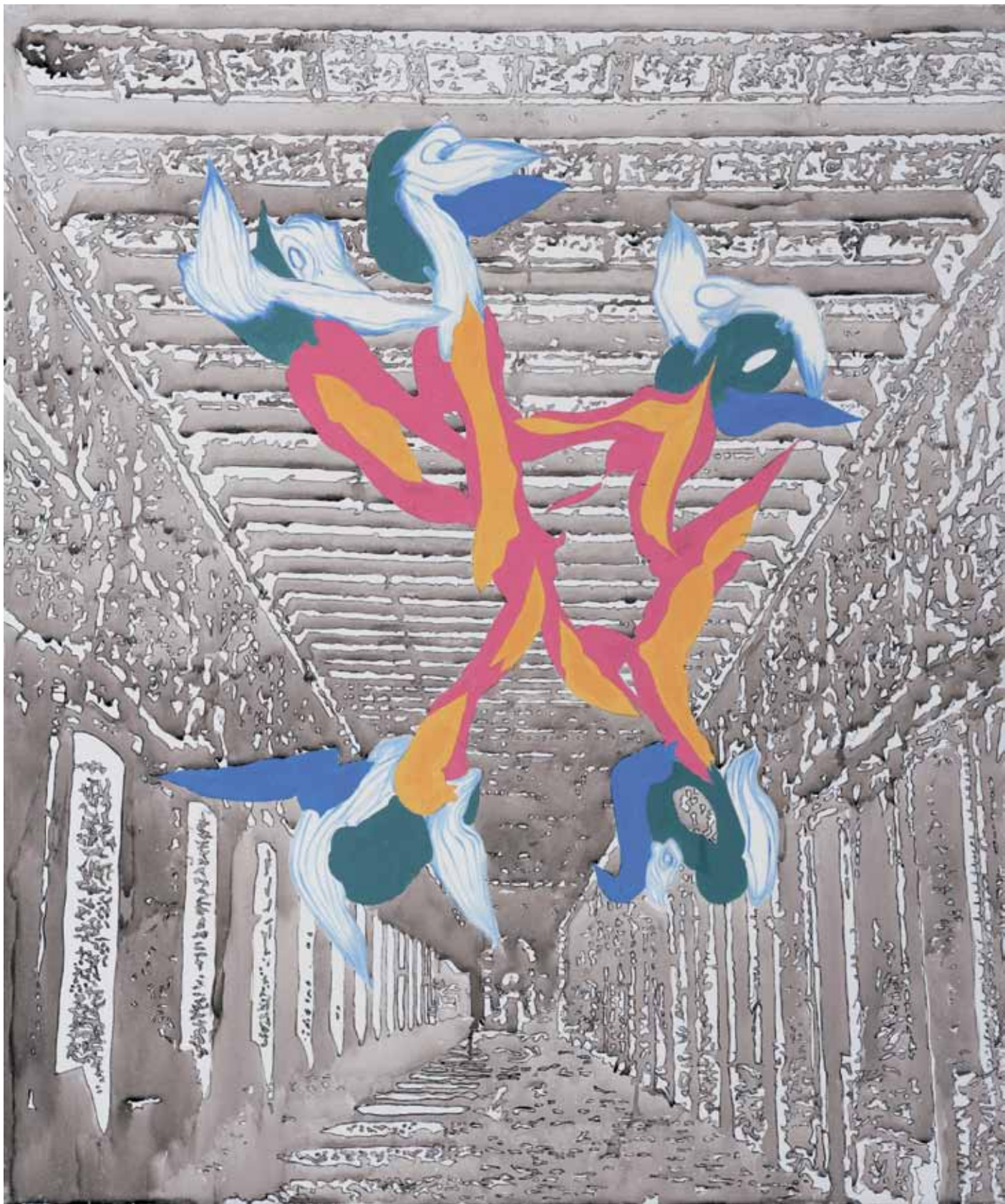
Krađa Mona Lise 1, 2006 akrilik i auto lak na platnu 110 x 100 cm