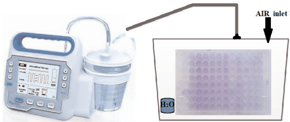
Figure 1. Design of the negative pressure system. The air was sucked from the chamber by Heaco-NP32S Vacuum Pump Device. The Heaco-NP32S Vacuum Pump automatically produces and maintains the negative pressure at -125\text{mmHg} in the airtight chamber, which was used as the incubator. The 96-well flat-bottom polystyrene microtiter plate inoculated with the cultures of interest was allocated in this chamber. The chamber was placed into the thermostatic ( 38^\circ\text{C} ) conditions for 24 hours. The room air was inflated into the incubator every 15min in order to maintain the oxygen concentration of about 20%. In order to maintain humidity, an open vessel with water was placed inside the airtight chamber.

Bacterial strains were obtained from the collection of Department of Microbiology, Vinnytsia National Medical