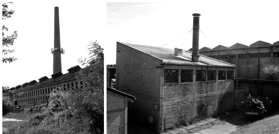
Fig. 2 and 3 Brick factory Polet and the area used as an open air cinema during the Festival 9

Festival 9 has taken place in the Trudbenik complex since 2015. This event helped to temporarily activate several more areas and buildings. All interview respondents confirmed that a very good cooperation was achieved among the actors during the festival. The cooperation began in the form of informal conversations with the local administration. The assistance provided by the municipality was not material, but rather moral and logistic, and consisted of support and referral to other relevant actors and institutions through formal, institutional, as well as personal contacts (e.g. using the old public transport company's bus for artistic interventions) (A. Jocić, personal interview, Nov 4, 2015; D. Kuzmanov, personal interview, Oct 27, 2015; V. Kiš, personal interview, Oct 27, 2015). The festival was supported by the owners and the administration of Trudbenik. They understood that such events contribute to increasing the attractiveness of the location, and have given one of the buildings for a temporary use without compensation (D. Kuzmanov, personal interview, Oct 27, 2015).