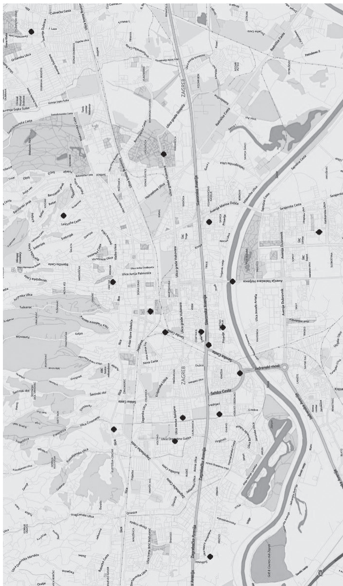
Figure 1. Nesting locations of Common Kestrel that have been analysed.

ties without specified nest location were recorded on one new square. Besides the locations on which Kestrels activities were recorded in the breeding season of 2017, additional 5 locations of once active nests were also included in the analysis of nesting sites (Figure 1), giving the total of 18 nests included in the analysis.