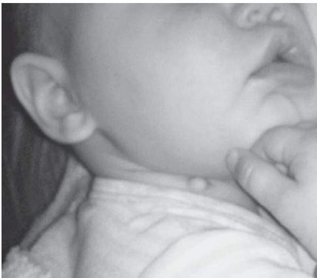
FIGURE 1. Atypical congenital cartilaginous rest on the right side of the neck.

complications (Figure 1). No other congenital malformations or minor anomalies were found, while her family history revealed no comparable skin lesions.