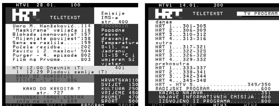
Figure 1: Basic HRT teletext page (No. 100) and TV programme schedule root menu retrieved on 28 and 14 January respectively

Teletext was almost omnipresent throughout Europe, as well as in some other regions where the majority of major television companies provided teletext services. Digitization of the distribution of television programmes has also brought new technical possibilities for rich information services, however, teletext has not been replaced, but integrated into new digital distribution platforms (European Telecommunications Standards Institute, 2017). In the Republic of Croatia, as in most other countries, digital television networks use the same teletext service as the one present on analogue television networks according to the DVB-TXT and DVB-VBI standards, which allow the emulation of analogue teletext on digital TV platforms directly on the TV or digital receiver.