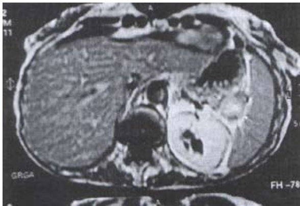
Figure 3. MRI of glucagonoma: the coronal T2-weighted image of the abdomen after IV-applied contrast, depicting the tumor mass as a high-intensity abnormality (3.0 cm × 2.5 cm) in the tail of the pancreas, lying at the splenic hilum.

nia were found. Glucagon level assay (EDTA-plasma) in two plasma samples taken during two separate exacerbations of skin rash showed elevated values: 386 ng/L; 290 ng/L; (normal range for adults 70-160 ng/L). Kidney function tests were normal.