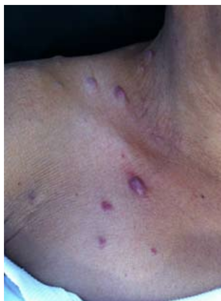
Figure 1C. Lesions on the upper anterior right trunk.