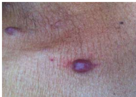
Figure 1D. Close up of lesions on the upper anterior right trunk.