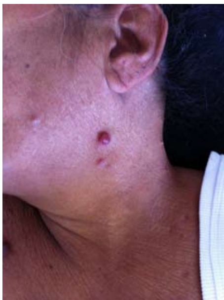
Figure 1A. Erythematous-purplish papule-nodular lesions on the face and neck.

The patient was hypertensive and had POEMS syndrome for 11 years, with peripheral neuropathy associated with monoclonal gammopathy, Castle-