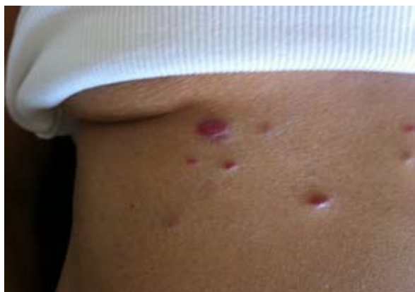
Figure 1B. Lesions on the infra-mammary region.