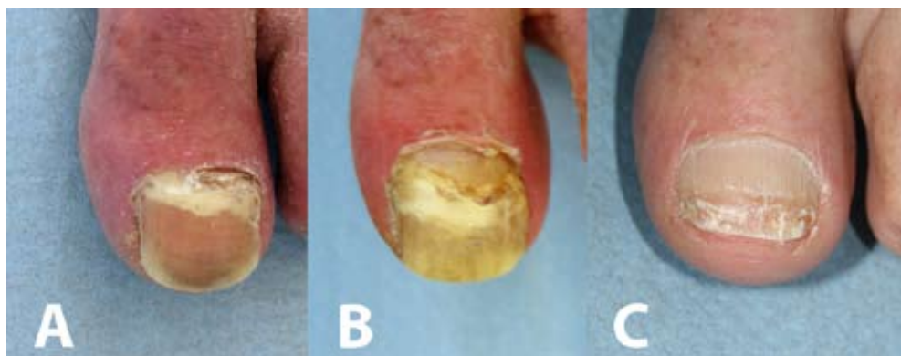
Figure 2. Clinical course of the patient 1: A) Presentation. B) Three months after treatment. C) Nine months after treatment.

TNF- \alpha inhibitors may reduce the inflammatory response to fungal infection. The cytokine is mainly secreted by macrophages and prevents the actions of IL-12 and interferon- \gamma and the migration of dendritic cells (5). TNF- \alpha inhibitors mainly suppress monocytes and dendritic cells, while MTX inhibits activation and