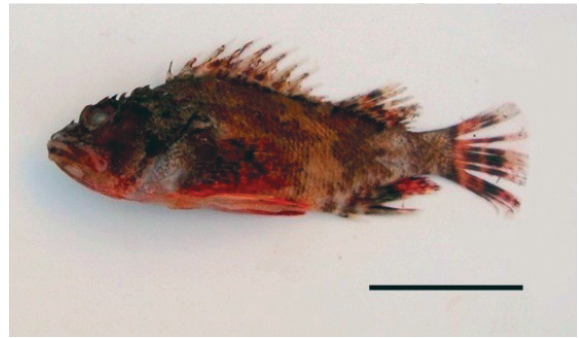
Fig.2. Scorpaena maderensis (FSB-Scor-mad 02), captured off northern Tunisia with scale bar = 40 mm

Information on two captures Scorpaena maderensis was provided by local fishermen familiar with these fishing grounds. The help of