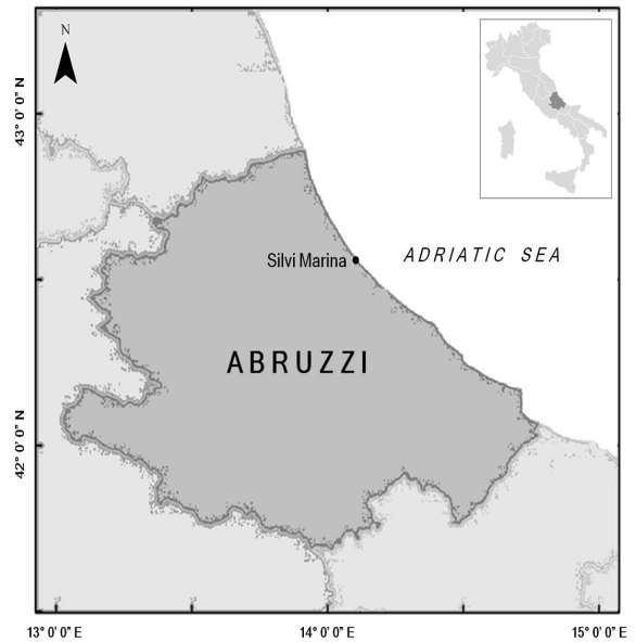
Fig. 1. New location of Codium fragile ssp. fragile along the coast of Abruzzi (central Adriatic Sea)

On 3 November 2015, one of the authors (RC) found and photographed a thallus of the macroalga identified as C. fragile stranded on the beach of Silvi Marina (central Adriatic Sea, 42°33'54" N - 14°06'25" E, Fig. 1). The finding of this subspecies was confirmed again on the