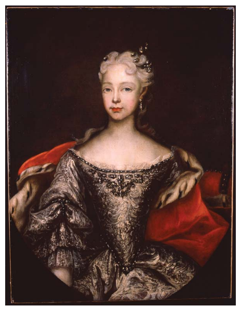
Picture 1. Unknown painter (Frans von Stampart?), Archduchess Maria Theresia

Source: Croatian History Museum, Zagreb (HPM/PMH 2428)