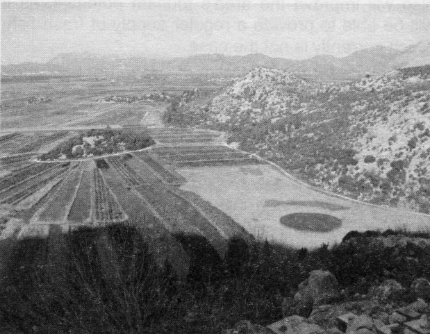
Figure 2. Examples of illegal and unplanned land reclamation. The right side of second picture features a remaining section of the original wetland habitat, along with a small lake.

Slika 2. Primjeri nezakonitih i neplaniranih isušivanja. Desna strana druge slike prikazuje ostatak močvarnog staništa uz malo jezero