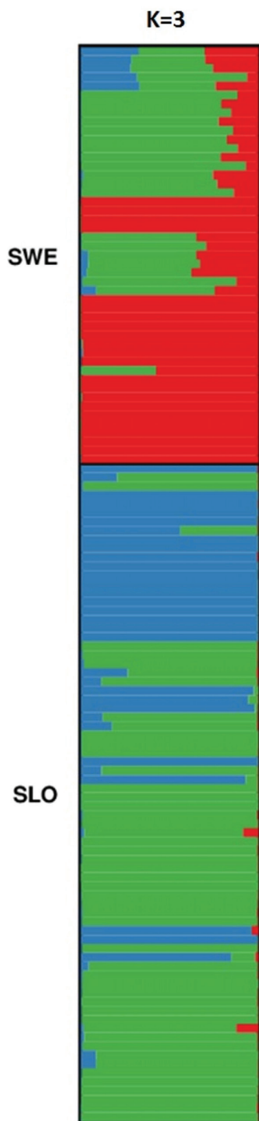
Fig. 2. Results of Bayesian clustering based on the microsatellite (SSR) and amplified fragment length polymorphism (AFLP) data of 121 Lactuca serriola samples from Sweden (SWE) and Slovenia (SLO), ordered according to the increasing latitude of the sampling site within a specific country. Each individual is represented by a horizontal line partitioned into segments of different color, the lengths of which indicate the posterior probability of membership in each group as identified by Structure.

from the southern part of Central Europe and the northern Balkans (representing ca. 1/3 of the Slovenian samples), the G-cluster represents the genotype largely dispersed across Europe, contributing significantly to the genotypic composition of the Swedish populations. The signal characteristic for genotypes from the R-cluster was nearly absent in the Slovenian samples, but was recorded in each sample from Sweden; and 48.9% of the Swedish samples fell into the R-cluster with no admixture signal (Fig. 2). For 19 samples, the signal from the R-cluster contributes up to 30% of a particular genotype, and is accompanied with an admixture of the G signal, which prevails in the Slovenian samples (Fig. 2). Further, we observed a nearly equal admixture of signals from all three clusters in five samples collected in southern Sweden near Malmö.