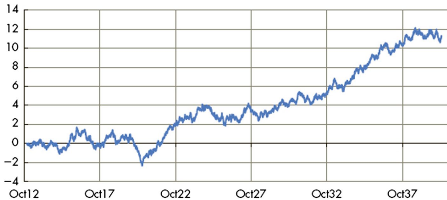
Figure 1. Random Walk. Source: Huggins and Schaller (2013; p. 19).

excessive profit. This model also provides an opportunity for the investors to get better future equity returns. Thus, econometricians try to calculate the actual potential of undervalued stock by using different techniques. The efficient market hypothesis is also described in terms of a random walk; it is very complicated to explore the undervalued company stock and its future performance (Mishra, 2017; Tripathy, 2017; Wang, Zhang, & Zhang, 2015; Zakamulin, 2016).