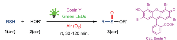
Table 1. Screening and control experiments. (a)

In order to work out the envisaged protocol, a key reaction was conducted with thiol 1(a–r) and alcohol 2(a–r) in 2 mol % of eosin Y under an aerobic atmosphere (without air bubbling) by irradiation with visible light (green light-emitting diodes (LEDs), \lambda_{\text{max}} = 535 \text{ nm} ) at rt.