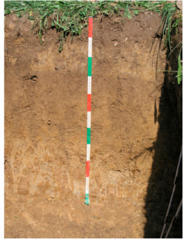
Figure 3. Landscape at the Sisak site No. 3 with the corresponding Profile No. 3