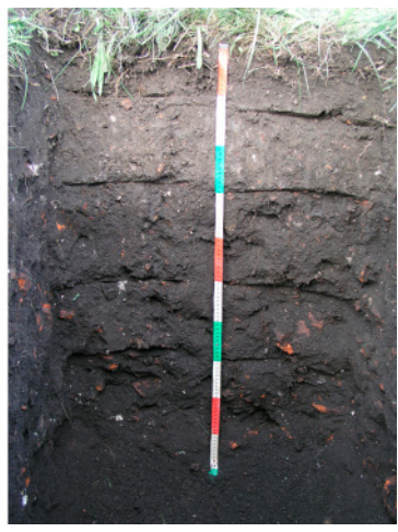
Figure 1. Landscape at the Sisak site No.1 with the corresponding Profile No. 1