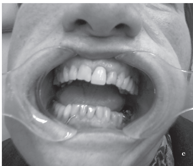
Fig. 6. The appearance of the patient ten years later: lower lip dysfunction due to marginal branch injury (a), and limitation of mouth opening (b) are permanent sequelae of the injury.