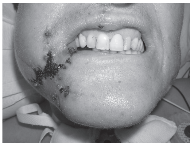
Fig. 3. Early result after first surgery – a small wound break has healed spontaneously.

cumflex iliac artery and vein. The graft was adapted to the mandible defect and fixed to the refreshed stumps by reconstructive plate (Figure 4). The occlusion of remaining teeth was completely preserved. No major complica-