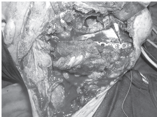
Fig. 4. Four months later the defect of the mandible was reconstructed by the iliac crest microvascular flap.