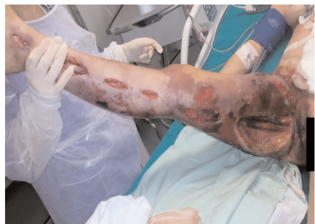
Figure 2. Right leg surgical incisions

Two days after the admission the decision to perform right hip exarticulation was made. Despite all measures taken the patient's condition continued to deteriorate and she developed multiple organ dysfunction syndrome