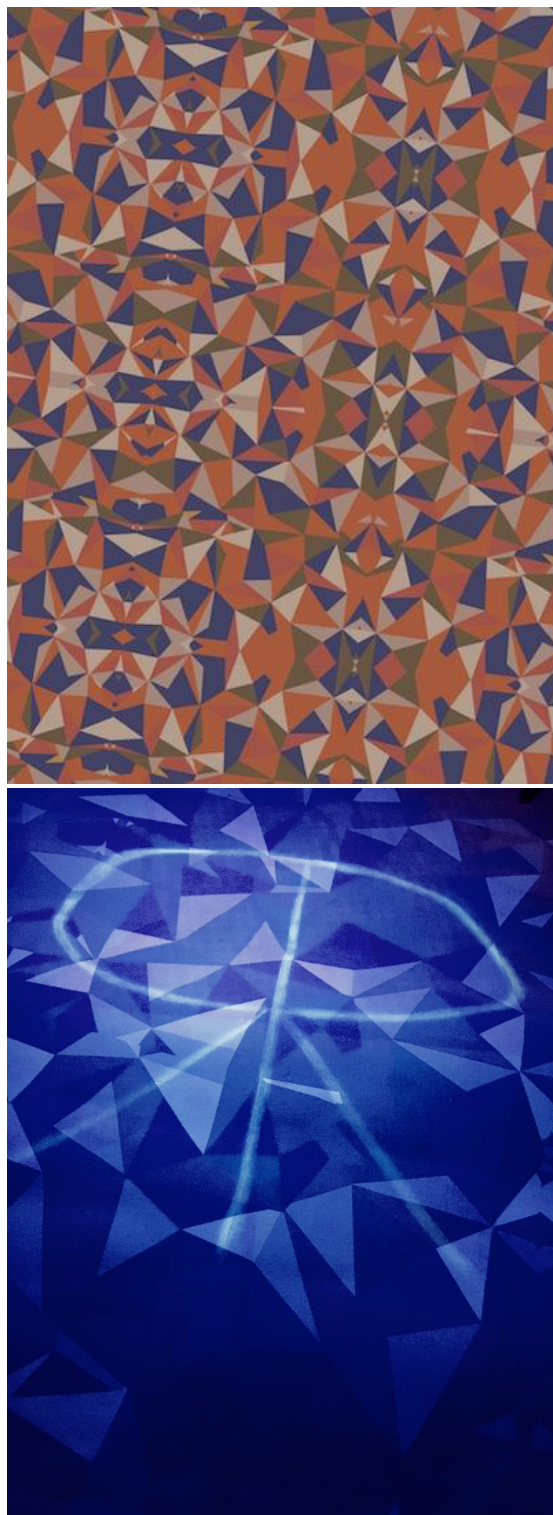
Figure 4. costume elements in the ultraviolet (UV) and visual spectrum (V)

By creating extended, three-spectral information on a single costume element, a space is opened up for the creation of new visual works. Information visible to the bare eye is visible under standard lighting, while the ultraviolet information becomes visible under black light.