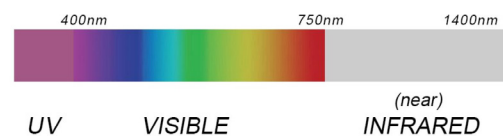
Figure 1. electromagnetic spectrum of the observed area

This paper presents costume printing with elements in three separate spectra. The observed area occupies the space of 360 nm - 1200 nm (Figure 1) of the electromagnetic spectrum. Individual values for each spectrum are visible due to different lighting design for each area separately. Every observed area is visible under a certain type of lighting. Ultraviolet and visual values are visible to the naked eye, with the addition of a special kind of light (black light). The infrared values become visible only by using electronic devices. Hidden values are printed in the created costumography using the InfrareDesign graphic technology. In order to see the infrared values, a hand-held ZRGB-M camera was used for parallel recording of the visual and infrared spectrum. The information imprinted into the costumes is shown only in a certain spectrum, while the other values of the matter are invisible to the eye.