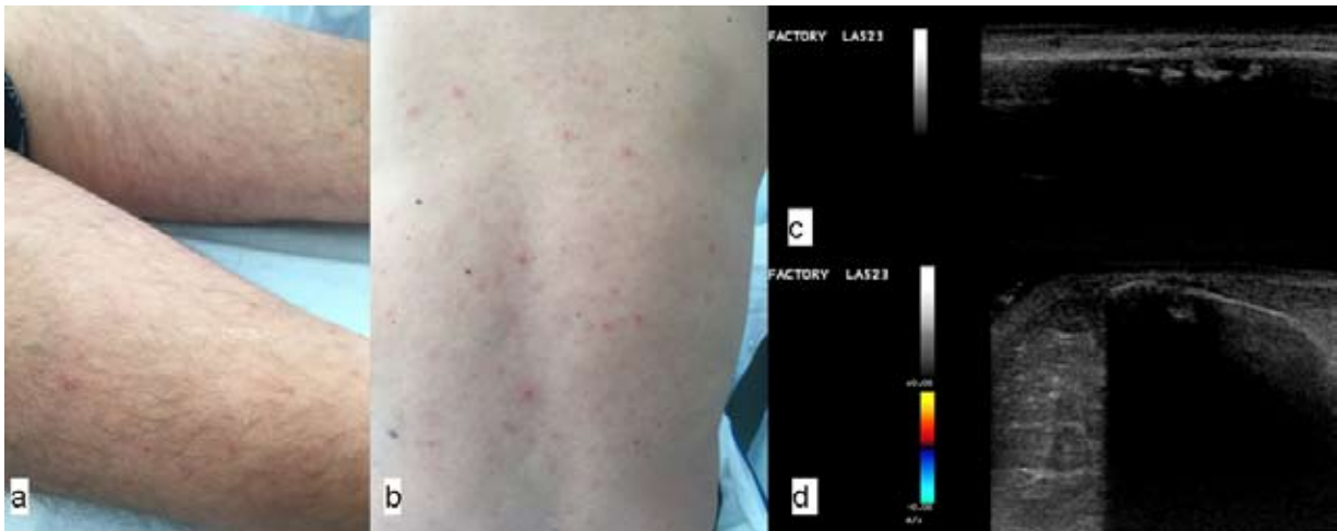
Figure 2. Case 2; clinical manifestations: erythematous maculo-papular rash on the limbs (a) and trunk (b); the ultrasound examination: thickening of the compact tibial bone associated with subperiosteal destructive and proliferative changes (c); (d)

A diagnosis of secondary syphilis was established, and the patient was treated with benzathine penicillin G 2.4 million units by intramuscular injection once a week for 2 consecutive weeks. The skin lesions regressed within 1 month, and serological tests showed a VDRL titer of 1:8 3 months after treatment.