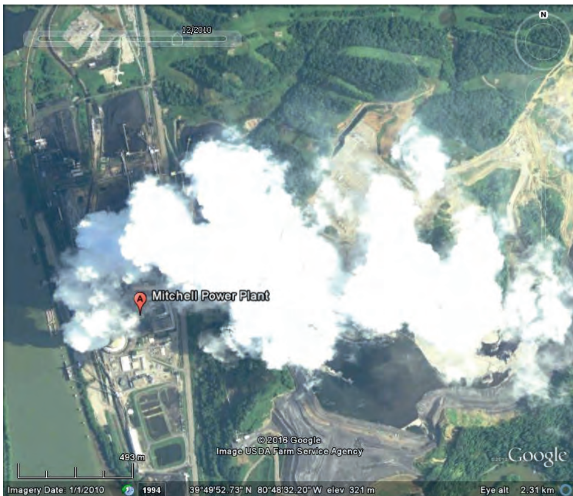
Figure 4. Satellite image of Mitchell plant in 2010

where C is the pollutant concentration (gr/m 3 ), x, y and z are the coordinates in the