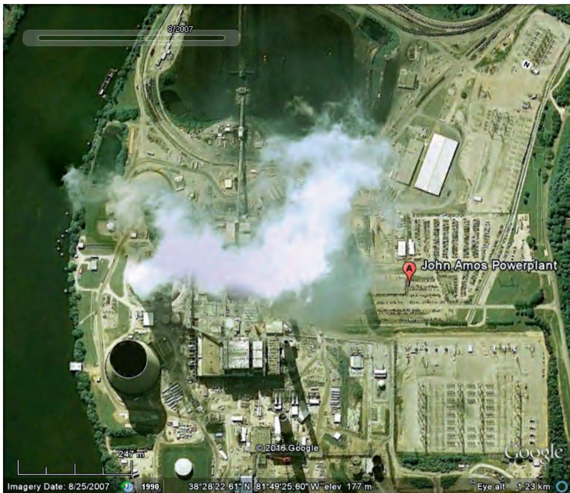
Figure 2. Satellite image of Amos plant in 2007

Slika 1. Shematski dijagram miješanja perjanica iz dimnjaka i hladnjaka.