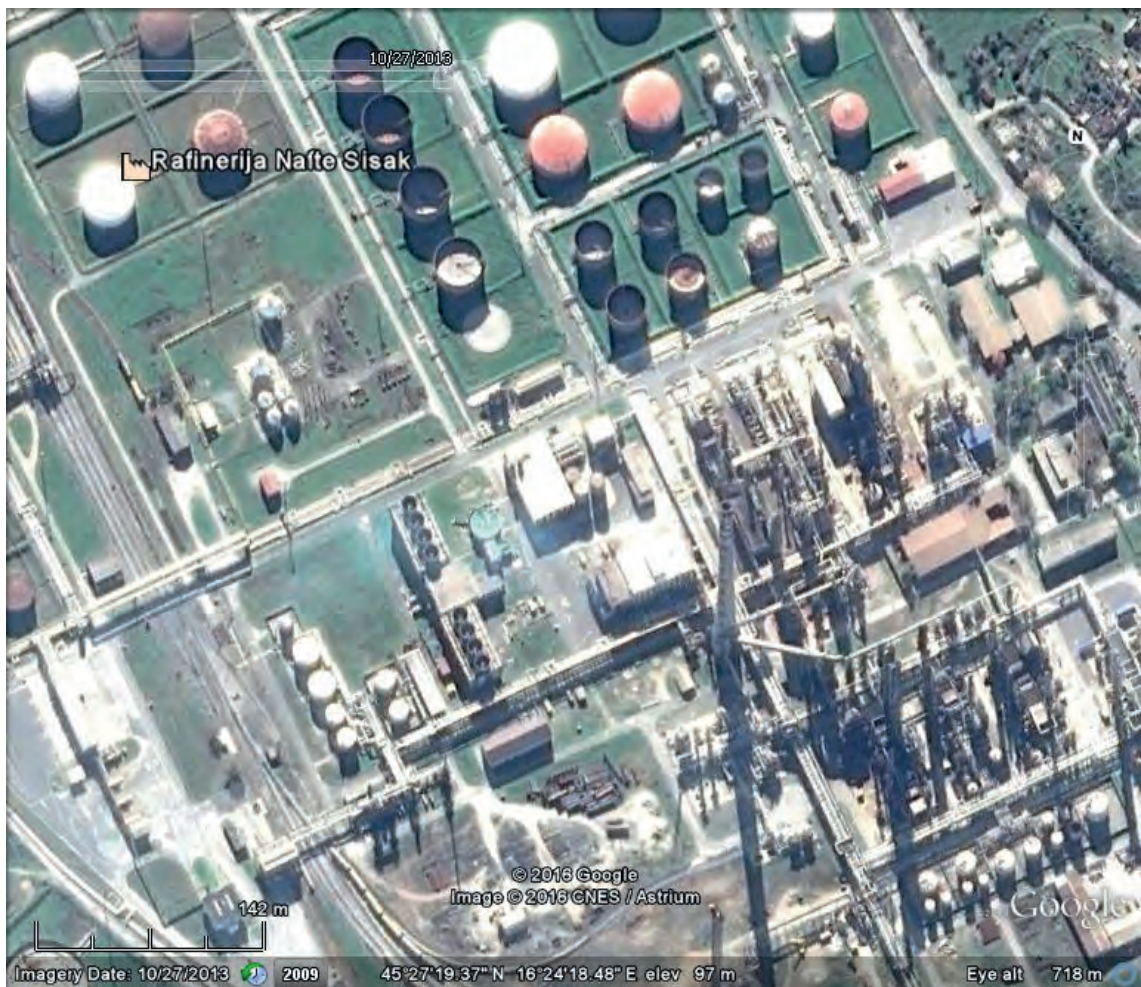
Figure 6. Satellite image of Sisak oil refinery in 2013

Slika 6. Satelitska slika Rafinerije nafte Sisak iz 2013. godine