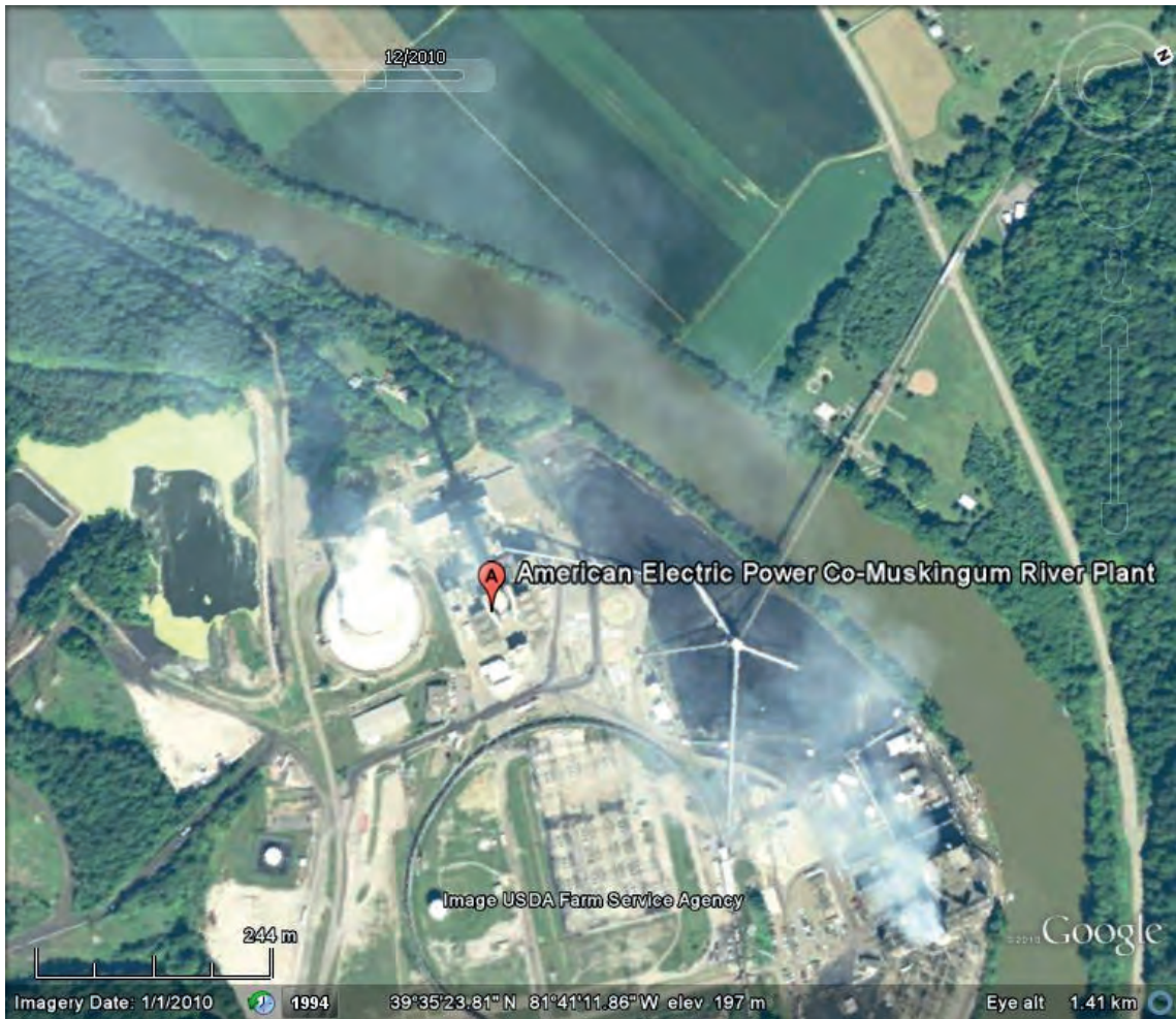
Figure 3. Satellite image of Muskingum River plant in 2010

Slika 3. Satelitska slika termoelektrane Muskingum River iz 2010. godine