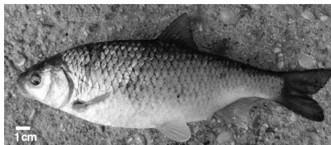
Fig 1. Neretva roach Rutilus basak (Heckel, 1843), 220 mm TL from the Hutovo Blato wetland, Bosnia and Herzegovina (photo by Nikola Zovko, January 2017).

In Croatia, R. basak is distributed in lakes and small rivers