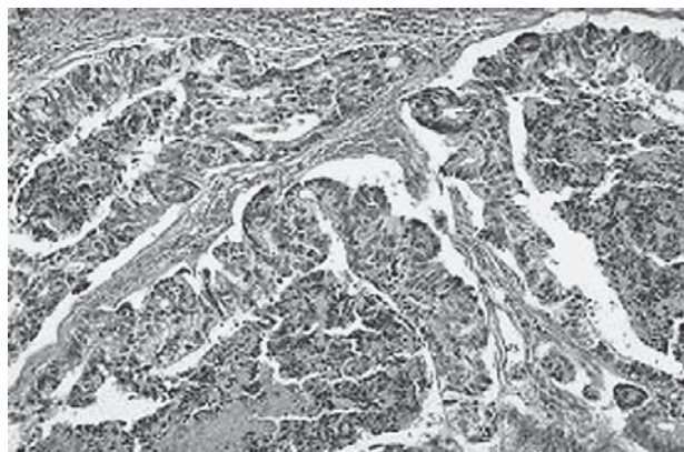
Figure 1. Adenocarcinoma ("NOS"), (original magnification X200)

from epithelial cells of the colorectal mucosa (5). Other histopathological variants of colorectal carcinoma, some of which associated with specific molecular characteristics include mucinous, signet ring cell, medullary, serrated, cribriform comedo-type, micropapillary, neuroendocrine, squamous cell, adenosquamous, spindle cell and undifferentiated carcinomas. Conventional adenocarcinoma is characterized by glandular formation, which is the basis for histologic tumor grading. In well differentiated adenocarcinoma >95% of the tumor is gland forming. Moderately differentiated adenocarcinoma shows 50-95% gland formation. Poorly differentiated adenocarcinoma is mostly solid with <50% gland formation. The terms "low-grade" and "high-grade" are nowadays in clinical, as well histopathologic, use due to the similar behaviour of well- and moderately differentiated carcinomas. Morphological grading of tumours applies only to adenocarcinoma, "NOS" (Figure 1), because other morphological variants carry their own prognostic significance.