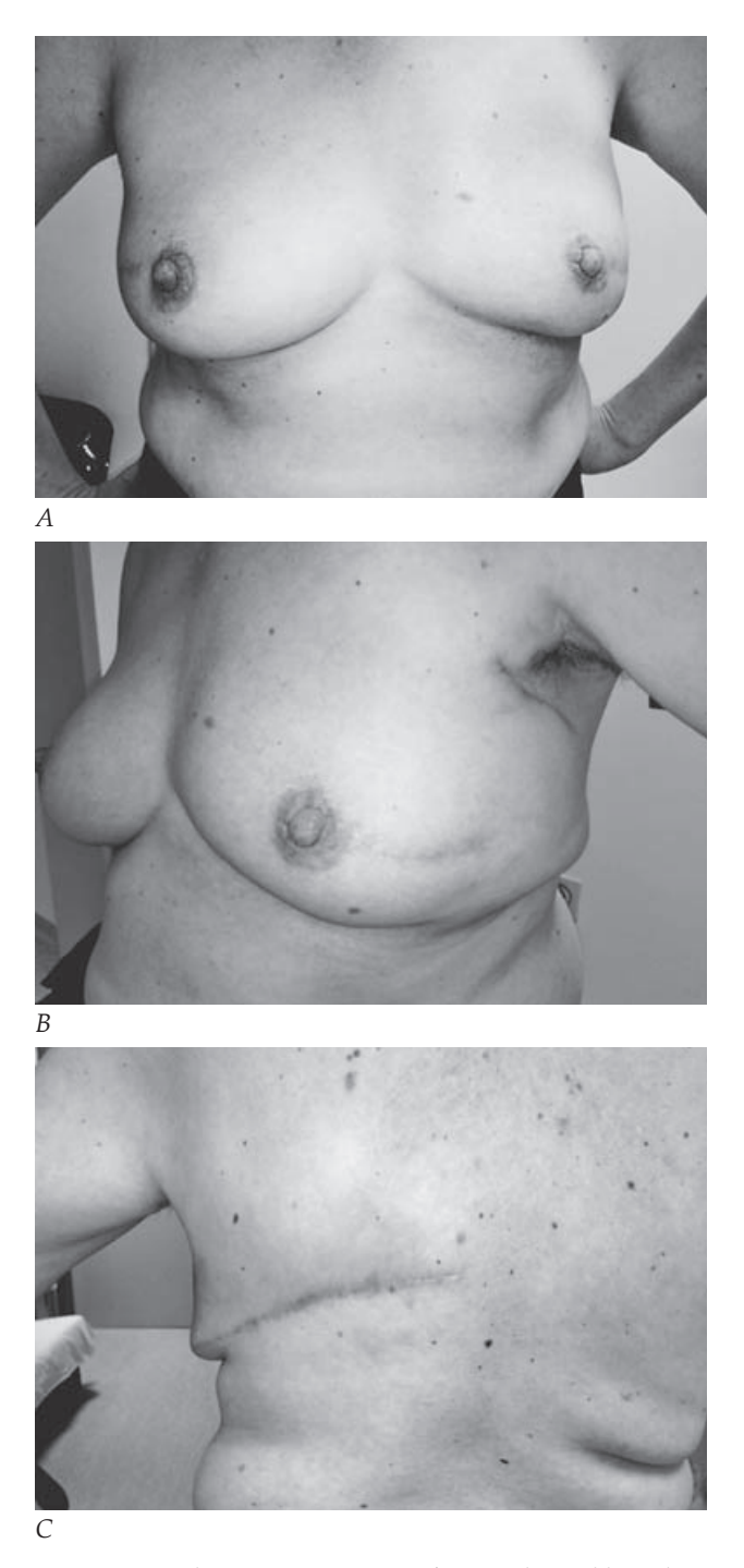
Figure 1. Nipple-sparing mastectomy/periareolar and lateral incision. A: A 56-year-old patient with invasive ductal carcinoma of the left breast (2 cm); The patient underwent a left nipplesparing mastectomy mastectomy with a peraireolar and lateral incision, lymph node dissection and immidiete reconstruction with latissimus dorsi miocutaneous flap. Biopsy of right brest showed benign lesion. B: Lateral wieew a one year later. C: dorsal wiew a one year leter

The SIEA flap is another modification that uses the superficial vessels rather than theirdeep