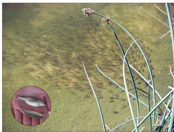
Fig 3. School of approximately 700 Rio Grande silvery minnow brood fish. The school is approximately 6 m 2 . The inset photograph shows gravid females. The plant in the foreground is softstem bulrush Schoenoplectus tabernaemontani .

cannot school. Schools that have been observed range from 5 to 4,000 fish. When there have been fish of various ages in the refugium, they schooled by age/size, a phenomenon that has been observed in other species (Couzin et al., 2006). This differs from that described for eastern silvery minnow, where schools of different sized fish were observed (Raney, 1939).