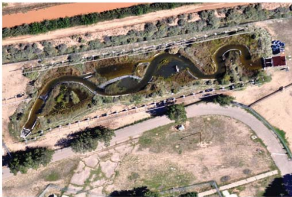
Fig 1. The naturalized outdoor refugium (refugium) at the Los Lunas Silver Minnow Refugium in 2012. The large island in Pond 1 has since been removed. The white “structure” in Pond 4 is two of the co-authors sampling fish with a 3.05-m (10-foot) seine. Sand Bars 1 and 2, which are discussed in relation to swimming behavior, can be seen. Sand Bar 1 is between the entrances to Ponds 1 and 2. Sand Bar 2 is downstream from the entrance to Pond 2 and is connected to the berm that separates Ponds 2 and 3.

The key component of LLSMR is the refugium, the first purpose-built, large-scale conservation aquaculture mesocosm. The refugium is designed to mimic the Rio Grande, including its hydrology. The refugium is 0.2 ha, with 0.11 ha of interconnected water habitats: a stream with sand bars, five ponds, shelves, marshes, attached bars, and overbank areas that can be inundated to create floodplains (Figs. 1 and 2).