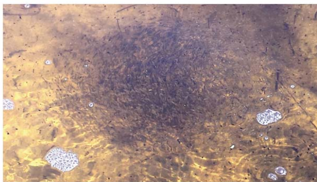
Fig 4. School of approximately 4,000 ten-mm Rio Grande silvery minnow. The school is approximately 0.18 m 2 .

Fig. 3 shows a school of about 700 adults (ca 60–75 mm) and Fig. 4 shows a school of about 4,000 ten-mm fry. When in schools, fish density is quite high. For example, density of adults in the school in Fig. 3 is about 117 fish/m 2 , and that of the fry in Fig. 4 is about 22,200/m 2 . It is possible that adult fish density could be greater, but our endangered species permit restricts us to maximum of 750 brood fish in the refugium.