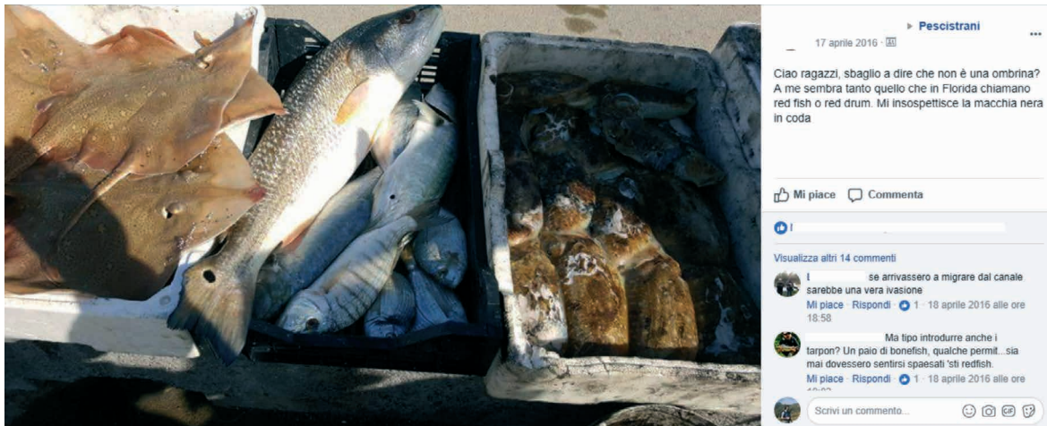
Fig. 2. Screenshot of the Facebook group 'Pescistrani' showing the posted record of Sciaenops ocellatus , along with doubts on the identification by the original observer

The typical shape and colour pattern of S. ocellatus , and in particular, the presence of a dark spot with a pale edge in the upper part of the caudal peduncle, allowed a certain identification of the specimen, following ROBINS & RAY (1986) and other field guides (e.g. FROESE & PAULY, 2016). Unfortunately the individual was not preserved, but its colour pattern is unique to the red drum and it has been already used to identify the species from the sole picture, when the specimen was not kept (GOLANI et al. , 2015).