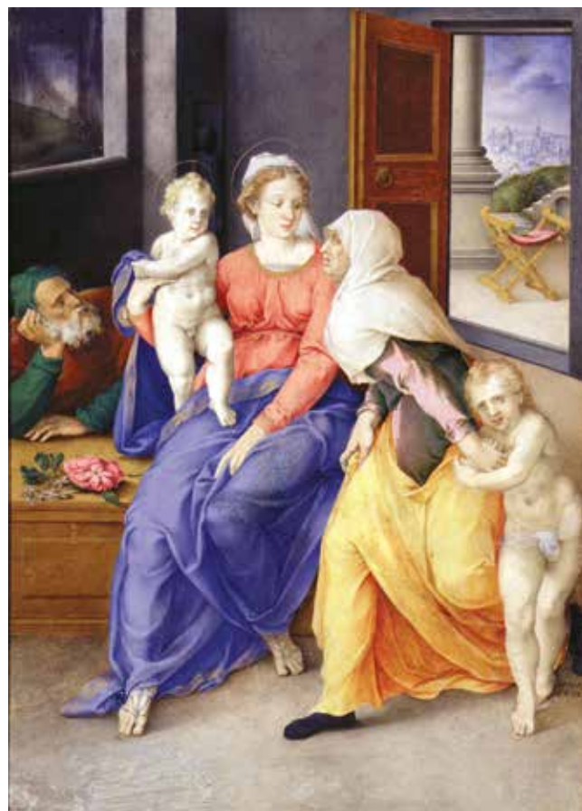
4. Giulio Clovio, The Holy Family with St Elisabeth and St John the Baptist, 1556/57, tempera and gold on vellum, 24 × 17.3 cm, Museo Lázaro Galdiano, Madrid, Inv. No. 540

Julije Klović, Sveta obitelj sa sv. Elizabetom, sv. Ivanom Krstiteljem i trima plemkinjama, druga polovica 1550-ih, tempera na pergamentu, Musée Marmottan u Parizu, Inv. No. M 6121