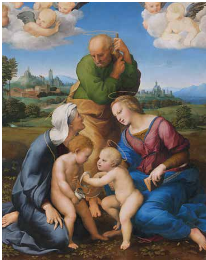
6. Raphael, The Canigiani Family , 1507, oil on panel, 131 × 107 cm, Alte Pinakothek, Munich, Inv. No. 476

Julije Klović, Sveta obitelj sa svecima, nedatirano, gvaš na slonovači, 19,6 × 14,3 cm, nepoznata lokacija