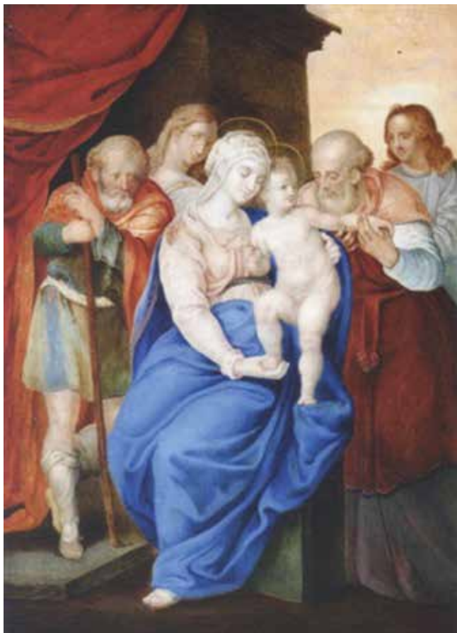
5. Giulio Clovio, The Holy Family with Saints , undated, gouache on ivory, 19.6 × 14.3 cm, unknown location

Julije Klović, Sveta obitelj sa svecima, nedatirano, gvaš na slonovači, 19,6 × 14,3 cm, nepoznata lokacija