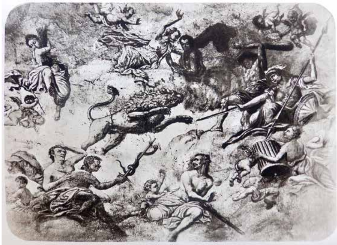
5. Reproduction of the allegory published in Károly Zrínyi's monograph on Čakovec (source: K. ZRÍNYI, note 3) Reprodukcija alegorije objavljena u Zrínyijevoj monografiji grada Čakovca

at the end of the 18 th century made him rather eclectic, 29 his skills far surpassed those displayed by the person who tried to retouch the canvas exhibited at the museum.