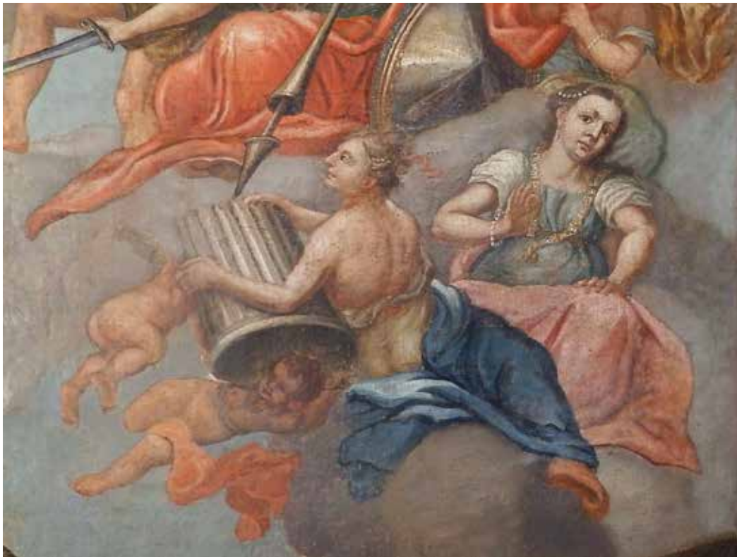
3. Detail of the allegory: personifications of fortitude and honour Detalj alegorije: personifikacije jakosti i časti