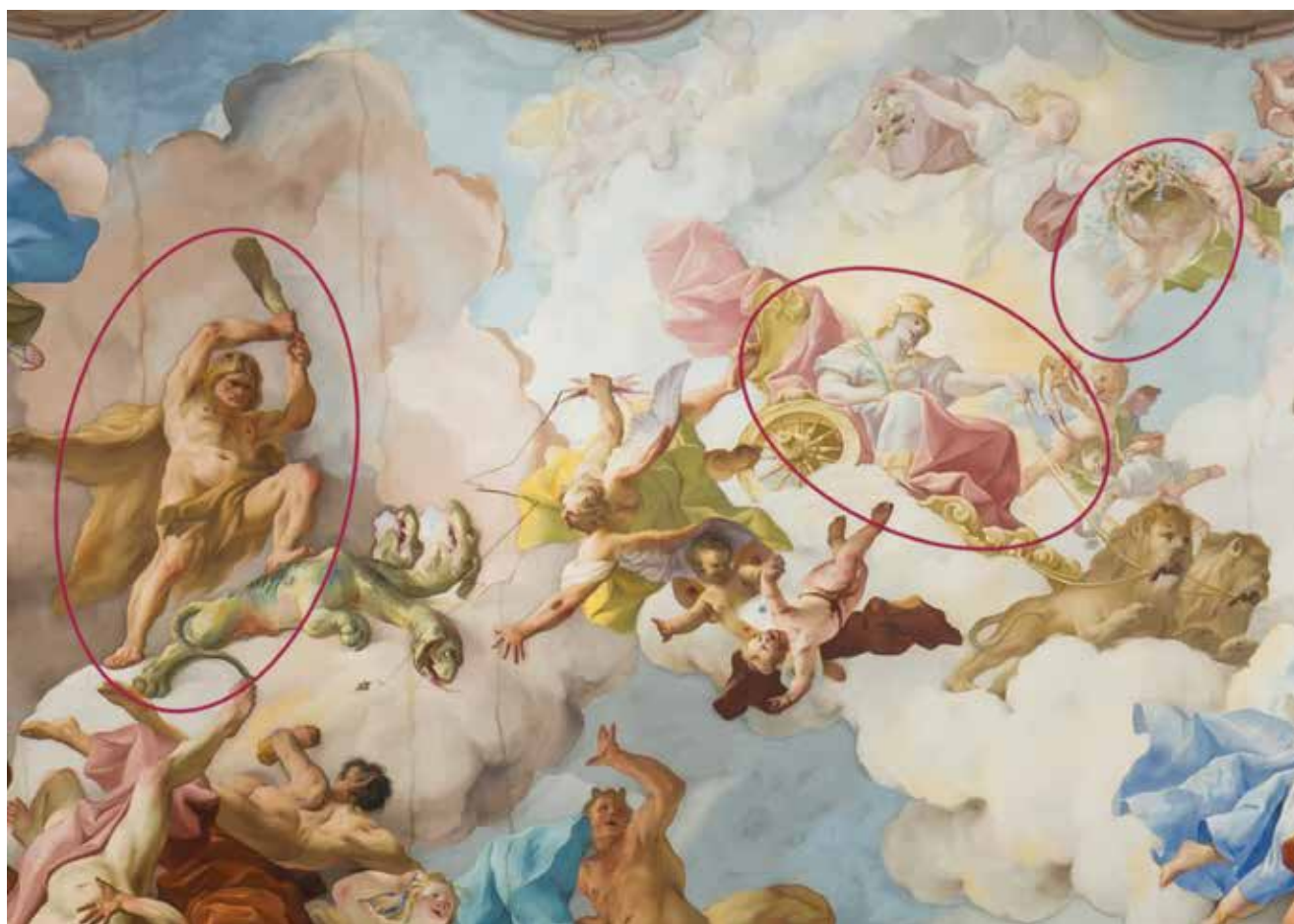
8. Paul Troger, Marble Hall ( Marmorsaal ) ceiling painting, 1731, Melk Benedictine Abbey Paul Troger, slika na svodu Mramorne dvorane (Marmorsaal), 1731., Melk, benediktinska opatija

distinguished guests – most notably members of the royal court – is adorned by a fresco showing Heracles fighting Cerberus in the presence of Athena, who is riding a chariot drawn by two lions (Fig. 8). They are surrounded by putti and figures representing vices and virtues, which indicate the fresco's symbolic reading: the struggle and triumph of virtue over vice, good over evil. 53 The fresco was painted by a well-known Austrian artist, Paul Troger (Monguelfo, 1698 – Vienna, 1762), in 1731. If we compare the Melk fresco with the Čakovec easel painting, we will notice particular similarities in the impostation of the two main mythological figures: that of Heracles with his arms raised high above his head forming a characteristic rectangular shape, and that of seated Athena with a slight inclination of the head following the movement of her outstretched arm and parted legs with drapery stretched between them. Similarities can also be found in the impostation of a third figure, namely the putto holding a flower basket in Melk, i.e. a column in the Čakovec painting (Fig. 3), with its right leg bent far behind.