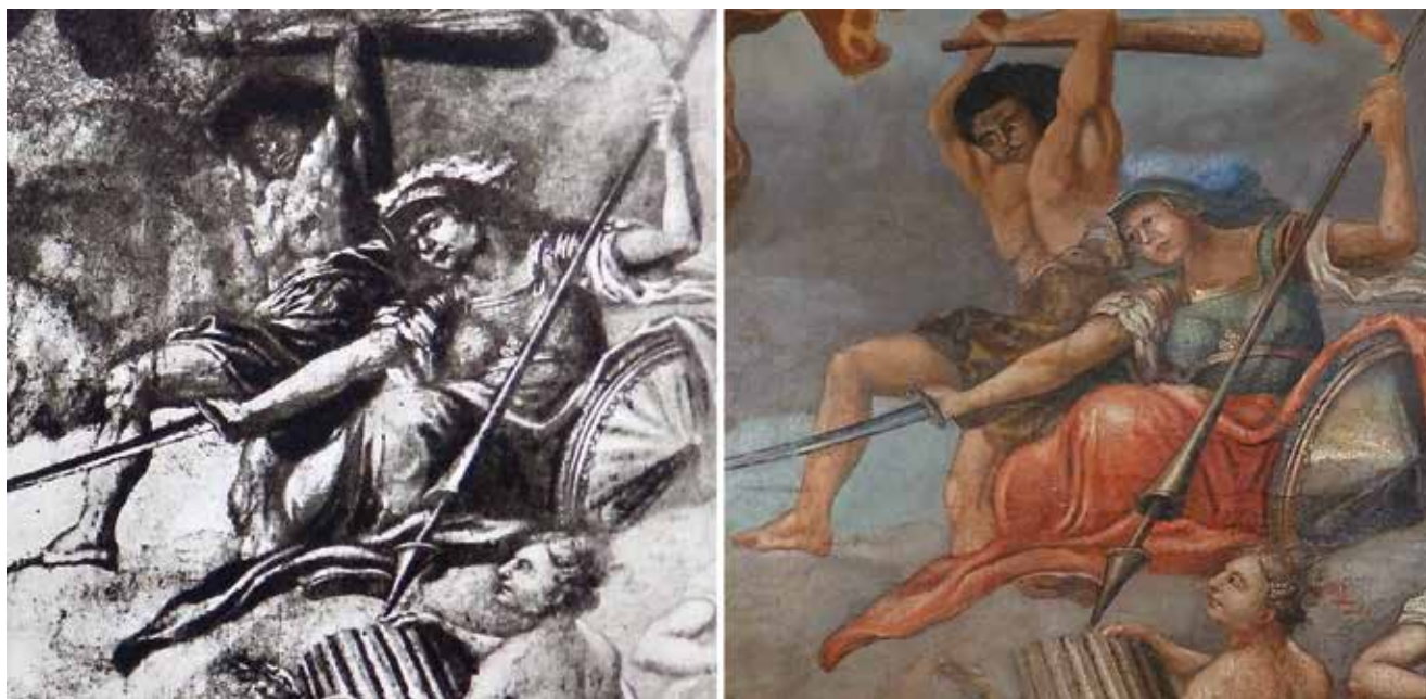
7. Comparison of the painting's former and present state: Heracles and Athena Usporedba prethodnog i sadašnjeg stanja slike: Heraklo i Atena