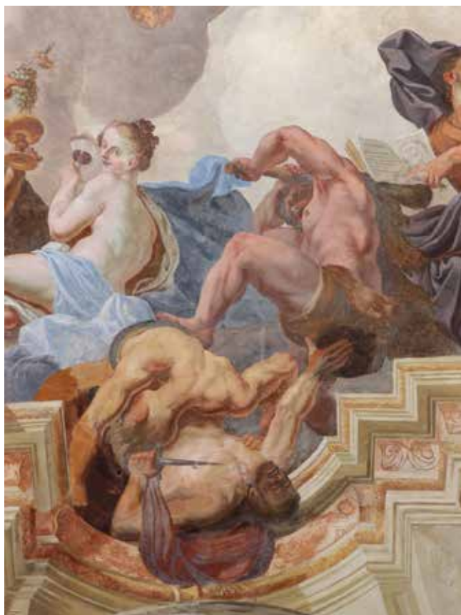
11. Johann Caspar Wageringer, Allegory of the Five Senses , detail, ca. 1718, fresco, Brežice Castle Johann Caspar Wageringer, Alegorija pet osjetila, detalj, oko 1718., dvorac Brežice

Maria, Count of Attems (Ljubljana, 1652 – Graz, 1732). 57 Apart from the mythological theme and basic compositional parallels (celestial background, the use of di sotto in sù ), the example from Slovenska Bistrica shares few similarities with the painting from Čakovec.