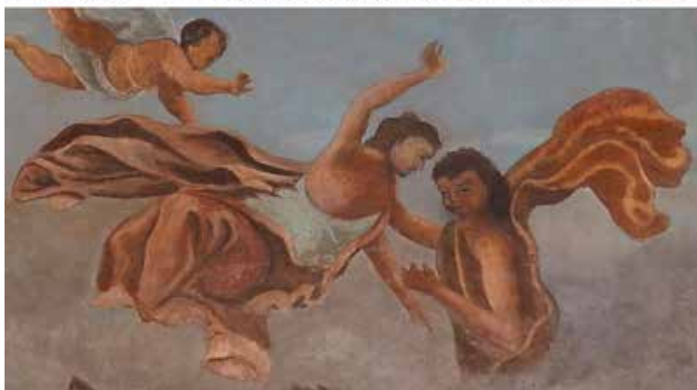
6. Comparison of the painting's former and present state: female and male figures

Usporedba prethodnog i sadašnjeg stanja slike: ženski i muški lik