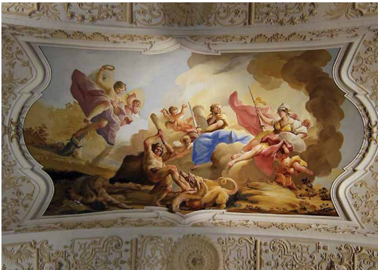
9. Paul Troger, Library ceiling painting, detail, 1733, Zwettl Cistercian Abbey Paul Troger, slika na svodu knjižnice, detalj, 1733., Zwettl, cistercijska opatija