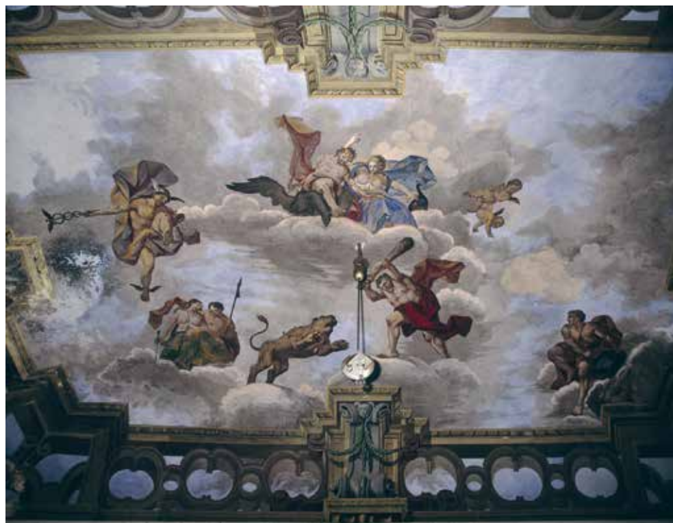
10. Unknown painter, Heracles' Apotheosis, end of the 18 th century, Donje Oroslavje, Vojković-Vojkffy Mansion