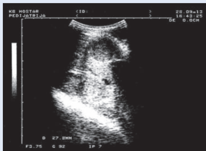
Figure 1. Ultrasound scan of Wilms tumor in right kidney