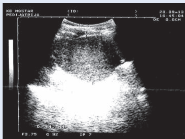
Figure 2. Ultrasound scan of Wilms tumor in left kidney