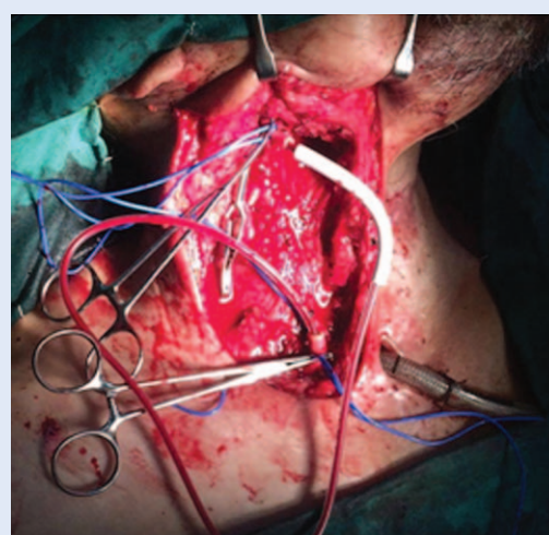
Figure 4. Shunting of the carotid artery was performed.