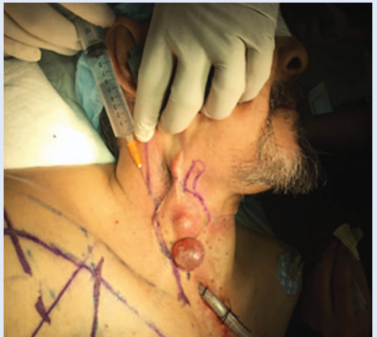
Figure 1. Recurrent neck tumour with skin involvement

Polytetrafluoroethylene (PTFE) graft was used for carotid arterial reconstruction and temporary in-