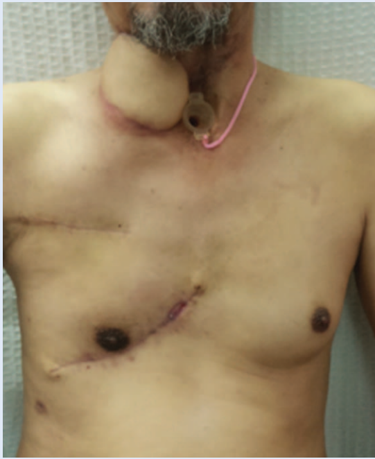
Figure 6. Tumour free and without any neurological deficits on followup

used to cover the defect (Figure 5). The total operative time was 7 hours. Immediate postoperative care includes keeping the patient's head at neutral (supine) position with mean arterial pressure range between 60-70 mmHg and was monitored at intensive care unit for three days. The patient was extubated at day two post operation. A higher mental status examination, cranial nerve examination and peripheral neurological examination (sensation, motor and reflex) was performed when patient regained full consciousness at four hour post extubation and showed no general neurological deficit. Intravenous cefuroxime was given to the patient on induction and continued post-surgery as an antibiotic prophylaxis for major surgery. The wound drain was removed after 4 days. The patient was discharged at day 10 post-surgery. Subsequent follow up at 9 months post operation showed no evidence of tumour recurrence clinically and the patient continued to enjoy good quality of life (Figure 6).