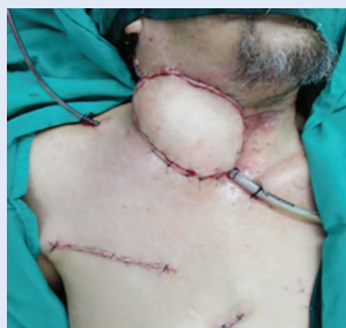
Figure 5. Pectoralis major myocutaneous flap used to cover the skin defect.