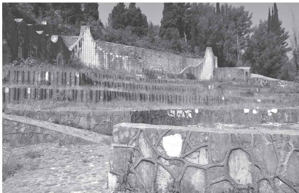
Figure 1: Partisan cemetery

cemetery. The Partisan cemetery is all the more remarkable for being constructed in Mostar, which prior to the war in the 1990s was associated with the concepts of multiethnicity and coexistence of different cultures that have left their mark in it throughout history. Bogdanović intended to emphasise the concept of multiethnicity when he designed the Partiza . 3 The monument's purpose was to provide Mostar residents, who fell in battle during the National Liberation War, with an afterlife without their memorial plates being separated in space or marked differently depending on their religious or ethnic background.