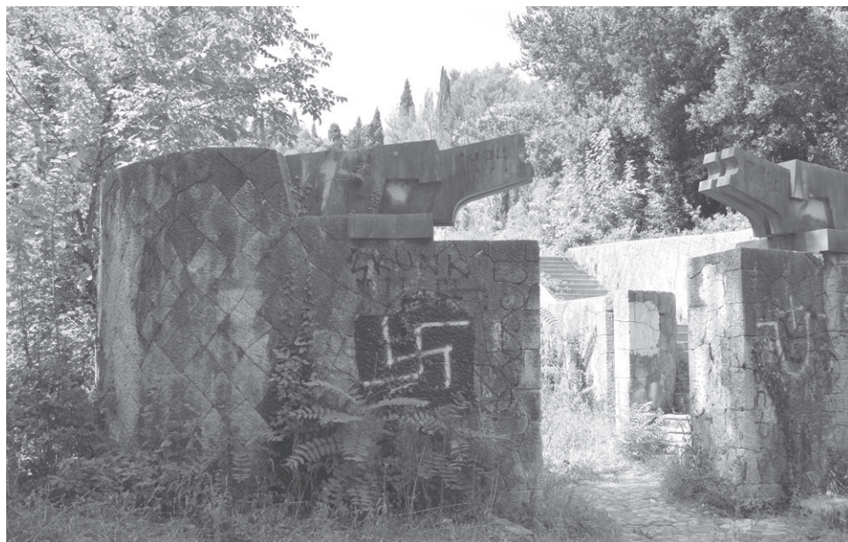
Figure 3: Entrance to the Partisan cemetery complex (Photo by Katarina Vasilj, 10/7/17)

movement in the space. Furthermore, it can be observed that no stone in the complex was left undamaged by subsequent interventions – the walls of the Partiza have been painted over and memorial plates broken and overturned. The whole promenade is covered in spray paint, mostly black. In many locations within the Partisan cemetery there are Nazi and Ustasha insignia, among which the letter U with “ears” and swastika prevail. Apart from the insignia, the walls are littered with hostile messages, especially towards Muslims, who are often designated in graffiti text as “ balija ” (derogatory term for Bosnian Muslims). One of the graffiti has a swastika under which numbers 14/88 are written, which are often used by neo-Nazi and racist groups. 19 Such examples show that the controversial memory is being expressed as a clash of messages that the monument dedicated to anti-fascist struggle, according to its authors, initially materialised, and its subsequent overpainting with symbols containing opposite connotations.