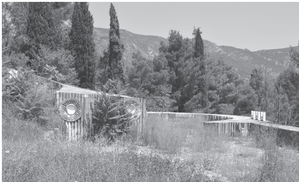
Figure 4: Neglected landscape of the Partisan cemetery (Katarina Vasilj, 10/07/17)

In her narrations, Asja disassociates herself from the dominant interpretation of Mostar as a hopeless city or a victim city, trying to give an active role to the Mostar residents in defining their city and the relationships in it differently, namely the possibility of action beyond the national divisions and conflict perpetuation. She interprets her suggestion that Mostar residents themselves should approach the Partiza differently in light of the fact that “Mostar can do better”.