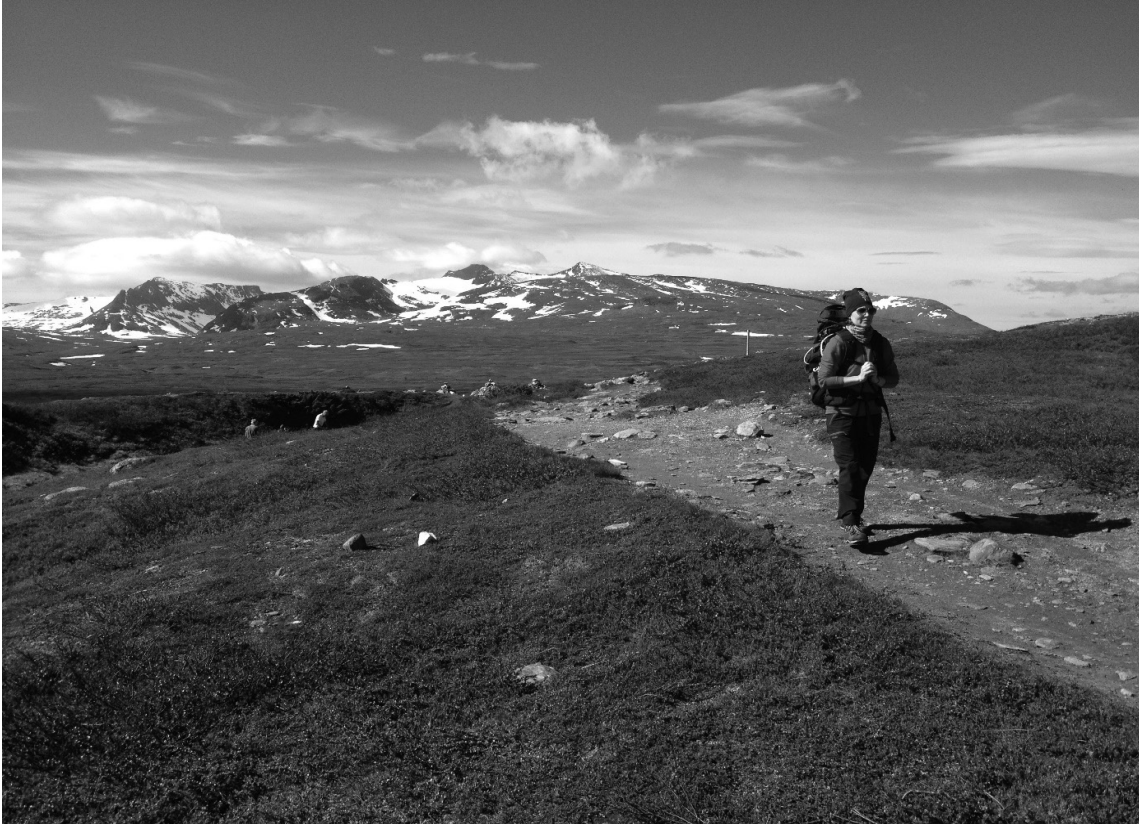
Figure 1 Hiker on trail in the Swedish mountains

In the following sections, we provide a detailed description of the approach used for the systematic literature review as well as the methods used for data collection. This is then followed by a presentation of the results and the paper ends with a discussion of the most important findings.