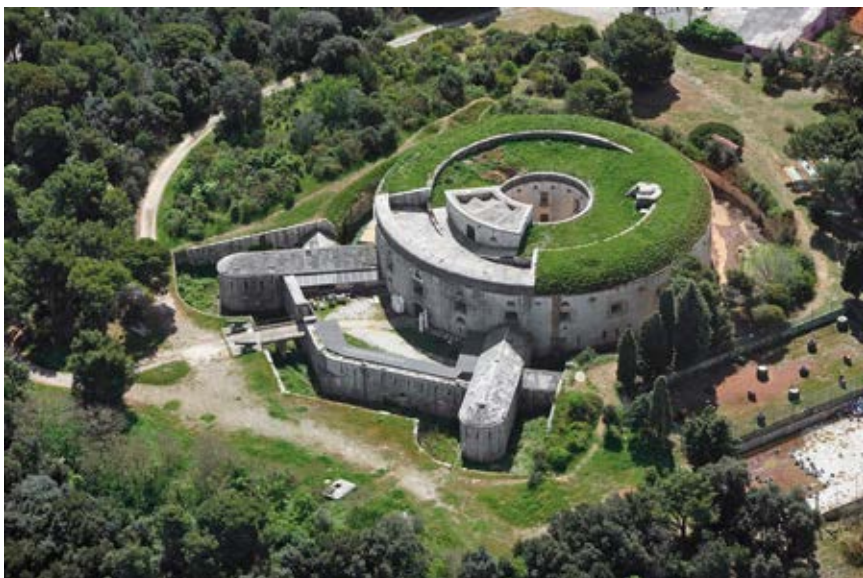
Figure 4: Fortress Punta Christo located in the II fortress area (Festung II), where war hospital should be located ( http://www.istria-culture.com/de/entdecke-s45?g=3 )