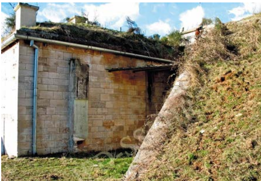
Figure 5: Fortress Castelliere, in which surrounding Hygienic Institute was located ( http://ipd-ssi.hr/?page_id=1318 )