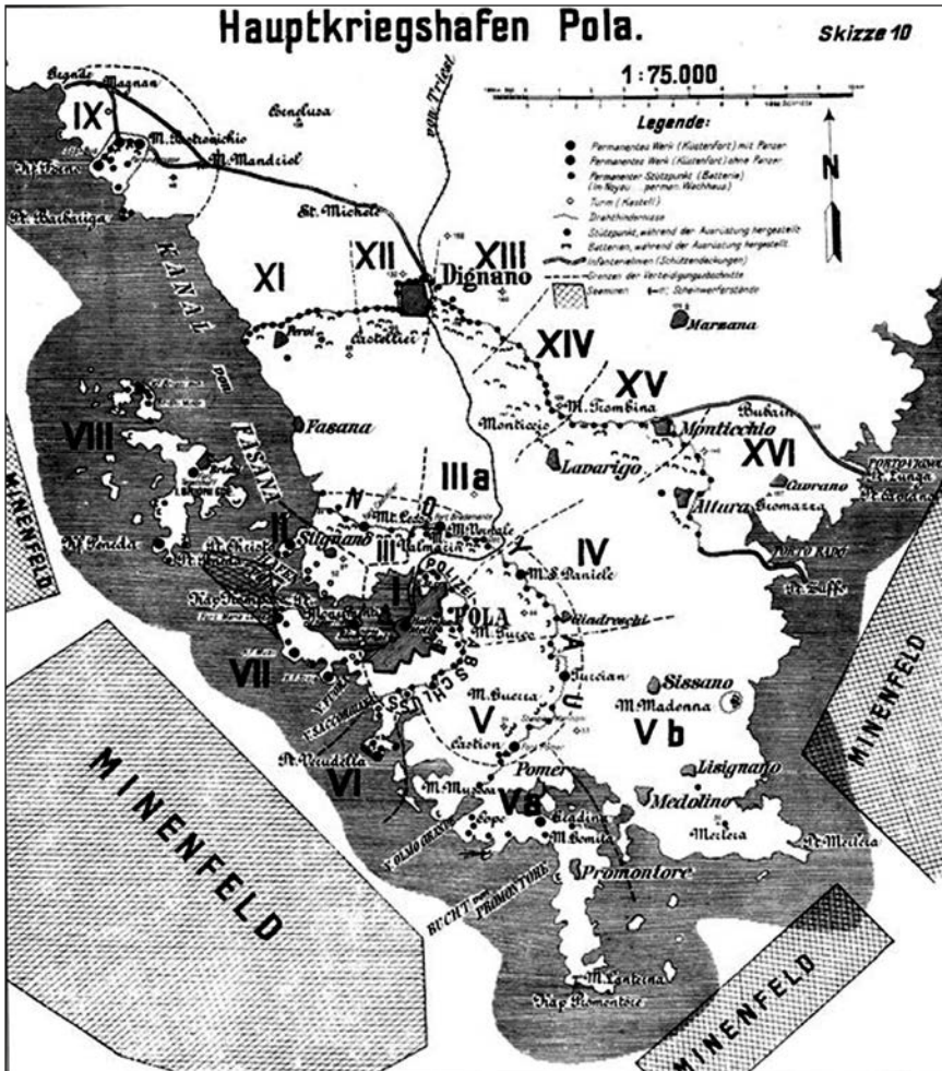
Figure 3: Fortress areas (Festungsrayon) surrounding the war harbor Pola (Pula) during the WWI

Brioni and to the inland towards Dignano (today Vodnjan), as given in Fig. 3. If this were true, the war hospital would be located in the area of fortress Punta Christo (Festung II area, Fig. 4), and the newly established Hygienic Institute in the neighboring Monte Casteliere (Festung IV area, Fig. 5). These are only assumptions that need further confirmation. Indications for the above statements are the call of the Regular Sanitary Commission (Ständige Sanitätskommission), published on August 7 th 1914, in daily news “Polar Tagblatt” (1914), with the authority to take over and use some of the land, private or public buildings, in particular fortress’ area (Festungsrayon) for sanitary purposes. The Commission was antecedent to the later founded