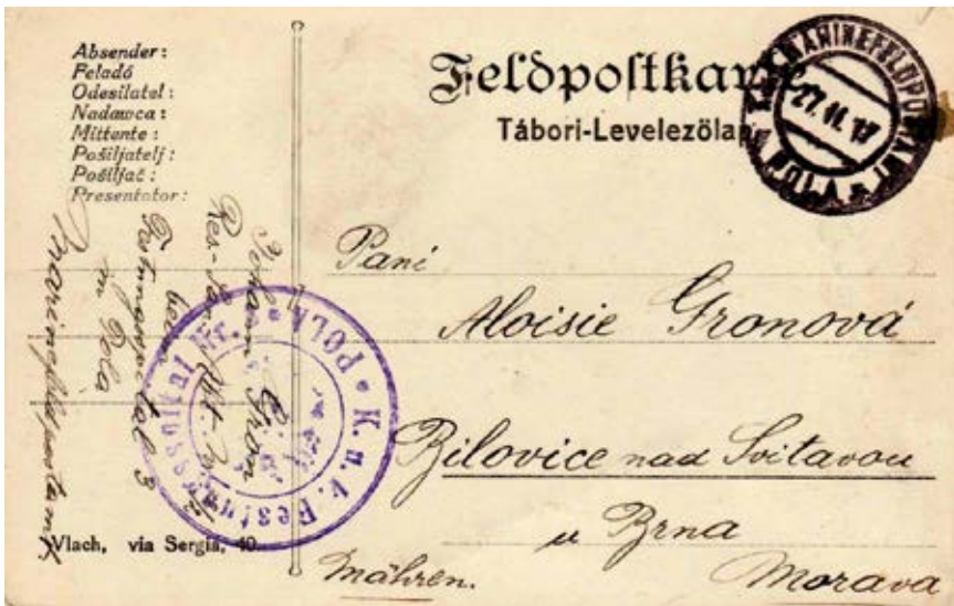
Figure 2: Postcard with the seal of Festungsspital 3 located in Pola (Pula)

The question was, what was the Festungsspital? The search for this word in German dictionaries did not help, and even a query sent to Austrian colleagues involved in history research. Though, there are still available for sale postcards sent from different Festungsspital during the World War I (WWI), including the one located in Pola (Fig. 2). Analyzing the word itself, it could be translated as Fortress hospital, i.e. hospitals founded during war times. Having in mind that Pola was surrounded with numerous fortresses (Festungs) built from Venetian to Austro-Hungarian times, one can assume that these locations were used for extended medical and sanitary needs during wartime. In fact, there existed 16 fortifications in Pola and its surroundings forming 16 fortification areas, from the coast to the island