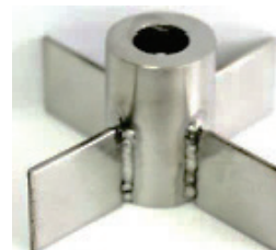
Figure 1 Straight blade turbine, SBT

Experiments for Taguchi method were carried out in a stirred batch reactor. The glass reactor with the internal diameter of T = 12 cm was equipped with four baffles placed at 90^\circ around the vessel periphery. The solution height, H , was equal to internal vessel diameter ( T = H ). The suspension, 1.3 l of copper solution and 5 g of zeolite, was stirred using straight blade turbine, SBT (Fig. 1). Impeller diameter was d = 6.5 cm, and its position, i.e. impeller off-bottom clearance ( C/H ) was varied in range from 0.20 to 0.46 (Tab. 2). As a source of copper, three different solutions with three initial concentrations (Tab. 2) were used. In order to enable comparison of experiments data all studies were performed at the same temperature ( T = 300 K), zeolite particle size ( d_p = 0.071 - 0.090 mm) and at the same impeller speed ( N = 250 rpm). At defined time (Tab. 2) the samples were taken from the reactor. Prior to the analysis with UV/Vis spectrophotometer, the samples were centrifuged and filtrated.