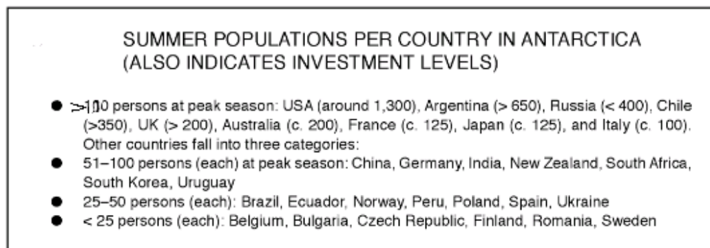
Figure 1: Antarctic summer populations by country, figure taken from the Handbook on the Politics of Antarctica

Culture in Antarctica is gradually becoming a subject worthy of study, with many more anthropologists and psychologists becoming interested in the way humans handle living in this