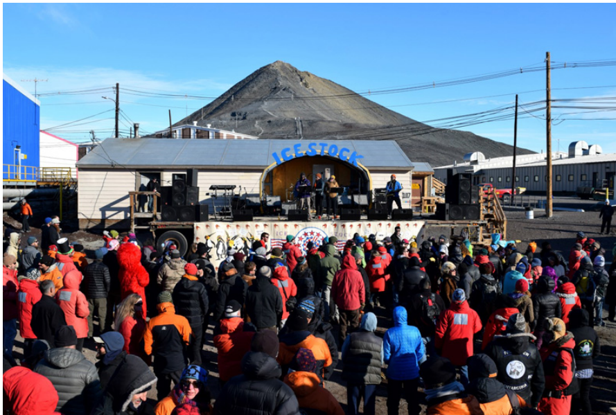
Figure 3: The crowd at Icestock 2016.