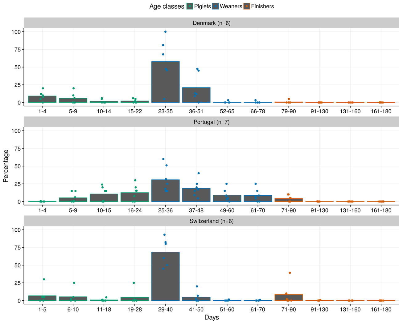
FIG 3 Mean proportion of treatments with oral colistin across the pig production cycle. Bars indicate the mean relative proportion of treatments with oral colistin in different age periods of the production cycle. Points represent individual expert answers. n, number of answers.

reflect differences in the prevalence of specific animal health problems and could therefore provide grounds to prioritise prevention/control measures.