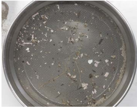
Sieve with particles >1mm from Swiss floodplain soils. Many of the particles are plastics, as confirmed by ATR-FTIR spectroscopy.