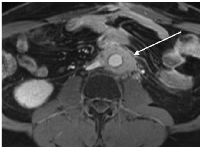
FIG. 1. Abdominal MRI pre-treatment showing a periaortic mass encasing aorta, inferior caval vein and in part the left ureter.