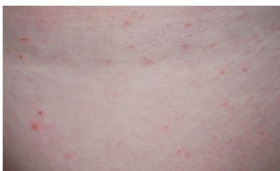
Fig. 3 Papules and erythema on the leg of the infested child

Both miniature pigs remained hospitalized for 14 days. During this time, an adequate feeding regime was started and a heating source was installed to control body temperature. Both pigs were treated with a subcutaneous injection of ivermectin (0.3 mg/kg; Ivomec®; Merial Ltd, Duluth, GA, USA), which was repeated after 2 weeks, combined with an intramuscular injection of butafosfan and cyanocobalamin (vitamin B12) (0.3 ml/kg; Catosal® 10%; Bayer, Shawnee Mission, KS, USA). Furthermore, the severely affected miniature pig was washed with a 3% chlorhexidine shampoo (Pyoderm; Virbac®, SA, Carros Cedex 06511, France) three times a week until scales and crusts resolved. The other miniature pig was washed only twice. No clinical adverse effects were observed throughout the treatment period. The owner