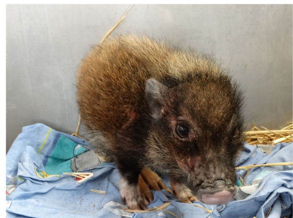
Fig. 1 Clinical photograph of the severely affected miniature pig with generalized hypotrichosis, multifocal hyperkeratotic crusts and erythema

Upon diagnosis of sarcoptic mange in this patient, the other miniature pig was also presented and examined. This animal showed a better body condition and comparable but milder skin lesions, consisting of mild hypotrichosis over the head and trunk and greasy skin with