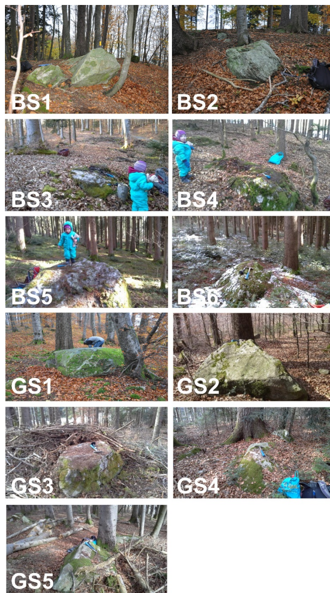
Figure 2: Pictures of the sampled boulders.

using boulders as large as possible, (4) flat topped boulders should be favoured and (5) marks of weathering should be considered as problematic. All samples meet the criteria for (1) as they are all granitic boulders. Criteria (2) is fulfilled for all samples but BS 3, BS 4, GS 4 and GS 5 which were found on the slope of the respective moraines but still in a stable position i.e. their bases are embedded in the sediment. If possible, we considered boulders with a height > 1 m (criterium 3). BS 3, BS 4 and GS 4 have a height of < 1 m. All boulders but BS 1, GS 2, GS 4 and GS 5 are flat topped and fulfil criterium (4). The only boulder that shows signs of weathering (criteria 5) is BS 1, which is broken apart. On the other samples we did neither detect physical nor chemical weathering.