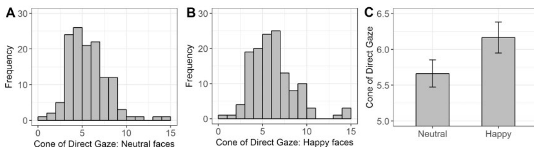
Fig. 2. Frequency plots of the CoDG for neutral (A), and happy (B) faces. Width of the CoDG across the two emotional expressions (C). Error bars depict standard errors.

Conjunction analysis (Figure 3C) clearly indicated that the width of both CoDG (i.e. for neutral and for happy faces) was correlated with the baseline current density in the theta band in the same neural region, the left TPJ/pSTS. Our findings were specific to the left TPJ/pSTS; in no other brain region was baseline theta current density correlated with CoDG at the corrected significance threshold. Interestingly, lowering the threshold, very similar results regarding the left TPJ/pSTS were found in the delta band ( P = 0.11 ; Supplementary Figure S1). No significant correlations were found in any other EEG frequency bands.