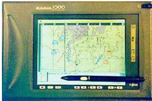
Figure 35.1: QuickSet User Interface

1980) and CUBRICON (Neal and Shapiro 1991) that operate on maps, and XTRA (Allgayer et al. 1989), an expert system for tax forms. One of the limitations of these early systems is the fact that they only allow for a limited set of deictic gestures in combination with language. In contrast, Koons and colleagues (1993) developed two prototype systems which are able to analyze simultaneous input from hand gestures, gaze and speech. The first system allows for interaction with a two-dimensional map. The second system enables users to manipulate objects in a 3-dimensional blocks world and includes not only deictic, but also iconic and pantomimic gestures. In QuickSet (Cohen et al. 1997), the user interacts with a map by drawing directly on the map displayed on a wireless hand-held and simultaneously uttering commands via speech. Drawing gestures in QuickSet include: map symbols, editing gestures and spatial features (see Fig. 35.1). Similar interaction styles are supported by the Map-based Tourist Information System described in (Cheyer and Julia 1995).