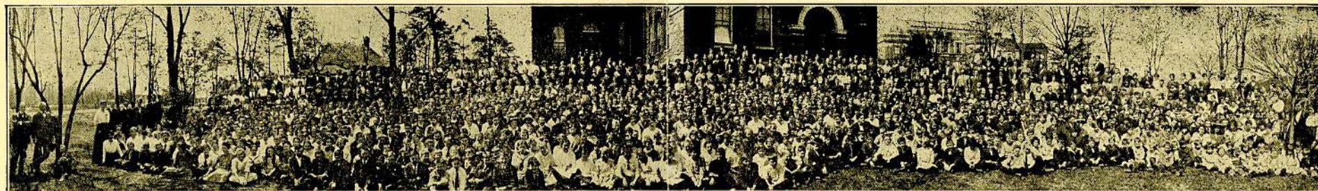
STUDENT BODY OF THE WESTERN KENTUCKY STATE NORMAL SCHOOL, BOWLING GREEN, KY.

A large, handsome half-tone cut, 9x35 inches, of the above, will be mailed in a tube free to all persons asking or writing for it.