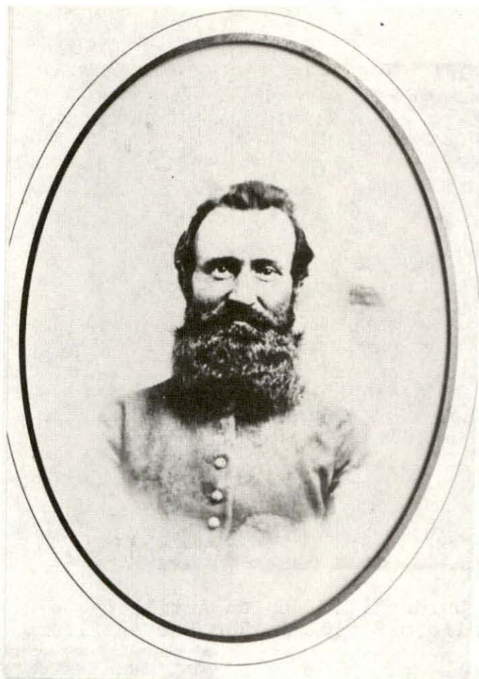
An Unidentified Confederate Soldier.