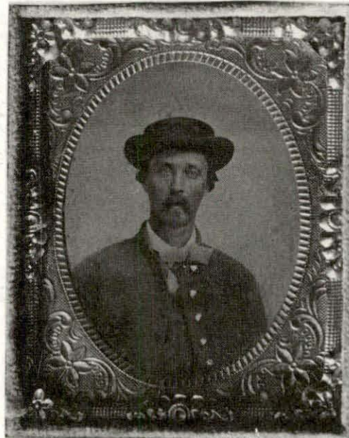
An Unidentified Confederate Soldier.