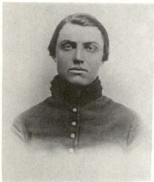
An Unidentified Confederate Soldier.