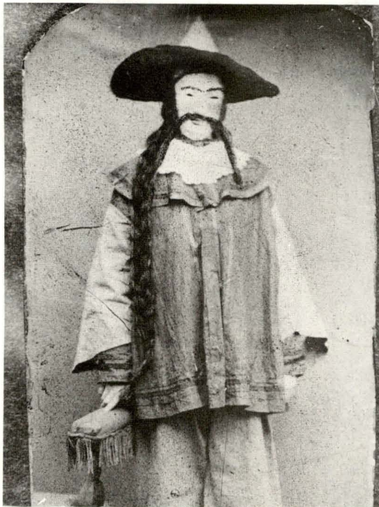
THE GHOST OF HALLOWEEN PAST