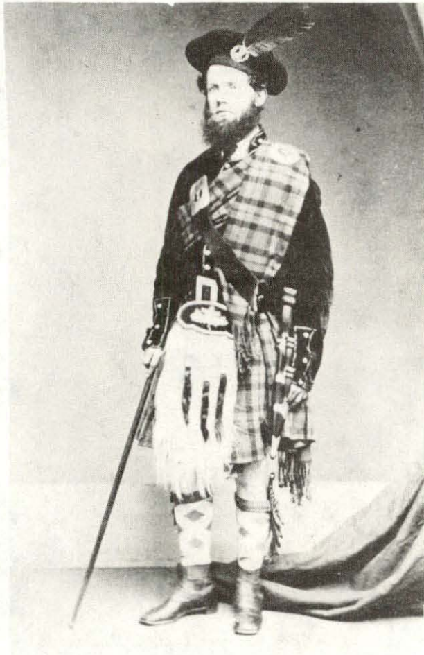
SCOTSMEN OF OLD - Jacob Moyer Album c.1865