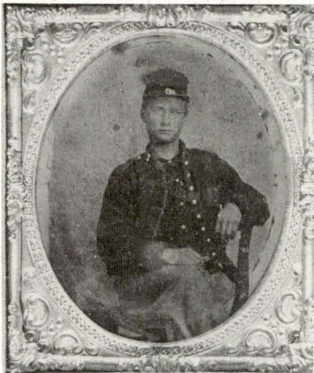
An Unidentified Union Artillery Soldier. (Uniform Facing Is Red For Artillery)