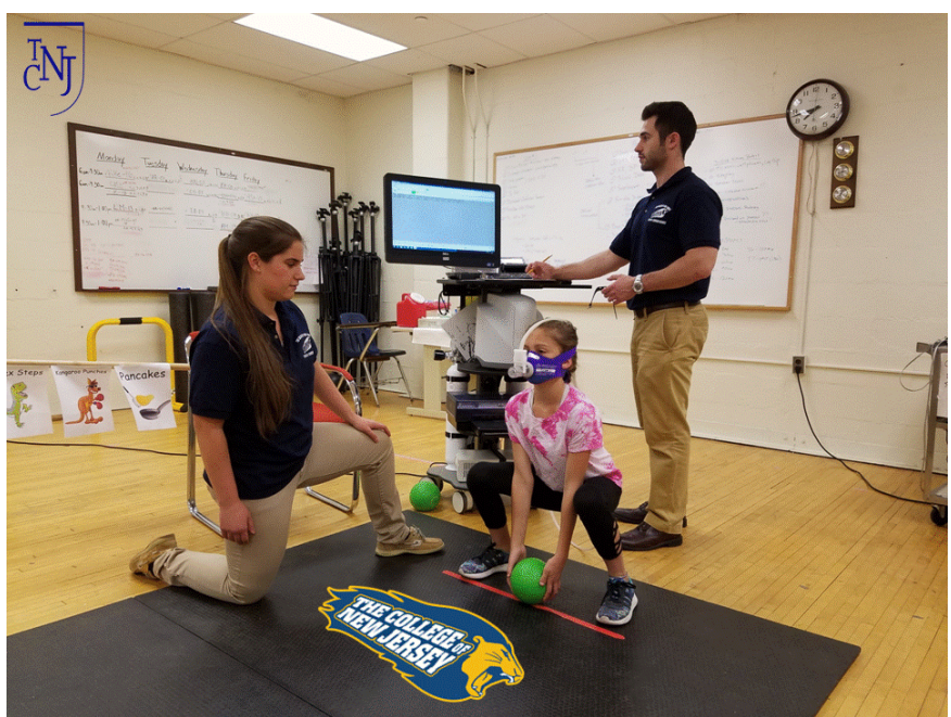
Figure 1 . Participant performing squat swing exercise while connected to metabolic cart. Parental permission was obtained to reveal the identity of the child.

Prior to the MBIT trial, each participant sat quietly in a chair for 5 minutes to collect baseline data. Subsequently, each participant performed 2 to 3 minutes of dynamic stretching (e.g., arm circles and knee lifts). Once complete, an approximate one-minute period ensued in which the researcher reviewed session instructions and the participant assumed the starting position for the first exercise. A research assistant monitored the number of repetitions during each time interval. During the MBIT protocol a research assistant periodically checked the facemask for proper fit. Participants were instructed to perform each exercise at a specific cadence with proper exercise technique. During each rest interval a research assistant provided a quick review of the upcoming exercise and reinforced exercise-specific coaching cues to maintain proper technique. Verbal encouragement was used consistently throughout the MBIT protocol was based on previous school-based interventions which included short bouts of exercise with 30 s of rest between sets and exercises (13, 14).