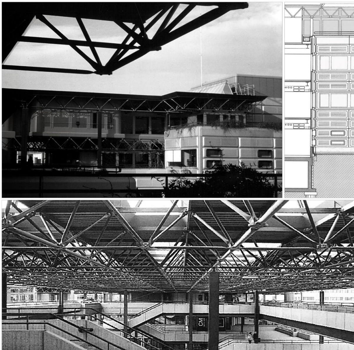
Figure 2. EPFL Campus, Ecublens, Switzerland (adapted from [35]).

The next case study is the first development of the campus of the Ecole Polytechnique Fédérale de Lausanne in Ecublens (Canton of Vaud, Switzerland) [35]. The initial design took into account possible changes in the type of teaching, research, and population. It resulted in an integrated, differentiated structure of interconnected 2- to 3-story-high buildings. A raised circulation floor separates car and pedestrian traffics. A roof structure covers all external circulations on the top floor.